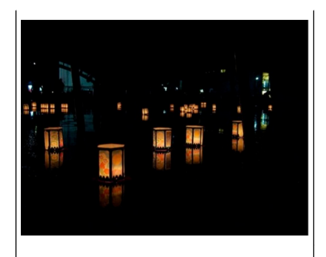
Obon lanterns bearing the names of tsunami victims, Kesennuma

The triple disasters of March 2011 have been described as a break with the past. The contributors to Japan since 1945 do not attempt to predict how those disasters will change Japan or the ways its history is already being told. But we are certain that, whatever directions Japanese take now - and they will most certainly not all take the same direction they will be building on their pasts, particularly their experiences, accomplishments, and failures, as all societies always do.