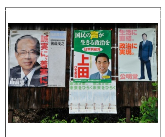
Election posters, Tsumago

(Bloomsbury 2013), grew out of two gatherings of scholars of postwar Japan. Unlike many pundits over the past two decades, the participants in the 2009 conference "Revisiting Postwar Japan" at Sophia University in Tokyo, and a workshop at the University of London's School of Oriental and African Studies in 2010, did not take for granted the value of studying Japan since 1945. In that volume, we focused on four issues: civic life, the legacies of war and military occupation, the emergence of a postindustrial economy, and the interaction of public memory with the social, political, and economic trajectories from the postwar to the post-bubble era. Our goal was to paint a more robust portrait of Japan's contemporary history by examining the social, cultural, and political underpinnings of Japan's postwar and postindustrial trajectories. More broadly, our ongoing collective goal is to cross the intellectual boundaries where history leaves off and other disciplines begin, in order to put to rest popular dismissals of Japan's relevance in the twenty-first century world.