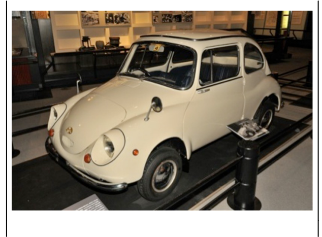
Subaru 360 manufactured from 1958 to 1971

Hiraku Shimoda's analysis of the Project X television series argues that even domestically there were dangers inherent in the nostalgia for the golden age of Japan's "greatest generation," the everymen (rarely are women foregrounded) who sacrificed and struggled to create the products on which growth and affluence were built. In the "good old days" of high growth, the Project X series asserts, when "death from overwork" (karōshi) was not yet a legally recognized cause of death, inventiveness, nose-to-the-grindstone determination, production, and consumption gave Japan its purpose and identity.