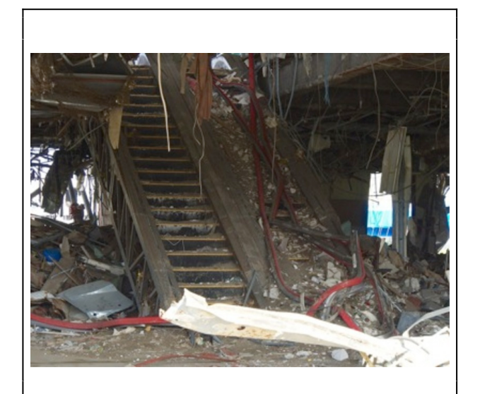
Store devastated by the March 11, 2011 tsunami, Rikuzentakata

to remember - or imagine - a time when things had been different.