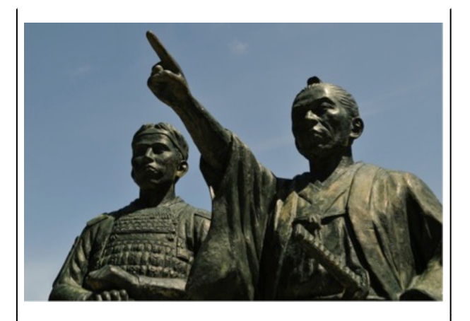
Statues of Bakumatsu heroes Takasugi Shinsaku and Yoshida Shōin, Yamaguchi

Positioning themselves in the dual role of proconsul and tutor, the mostly American officials of the Allied Occupation of Japan (1945-1952) translated their social and political vision of democracy into a constitutional monarchy for Japan that embraced the rights of free speech, formal gender equality and a "minimum standard of cultured living." Yet, while the Allied Occupation is often characterized as a liberal "New Deal" for Japan, reactionary strains within the American political system, in particular the rise of anti-Communism and the onset of the Cold War, also had tremendous repercussions for Japan. They strengthened the hands of its more conservative politicians and left the nation no choice but to join the American side in a polarized world.