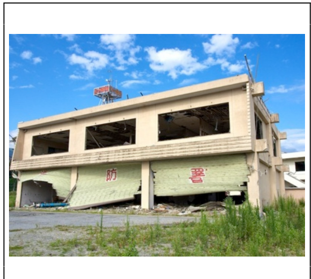
Firehouse devastated by the March 11, 2011 tsunami, Rikuzentakata

the point that it has been quite fashionable to publicly wonder whether Japan really matters anymore.<sup>2</sup>