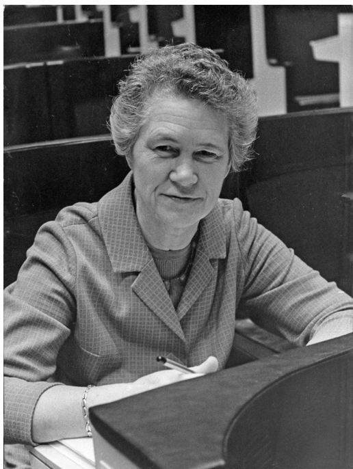
FIGURE 4.3 Politician and diplomat Inga Thorsson, a strong advocate of women's rights, nuclear disarmament, and international development, who sparked the Swedish initiative at the United Nations in 1967, leading to the convening of the Stockholm Conference five years later.

main thrusts (though perhaps not the acclaim of poverty) was shared by Thorsson, who also questioned aspects of patriarchal industrial society and its reliance on the unconstrained advance of technology. 34 Wägner, a study circle supporter teaching at a women's "folk high school" for rural women with little formal education and also a member of the Swedish Academy that awards the literary Nobel Prize, had become a controversial figure for her 1941 book. Not everyone liked its ideas of small-scale economics. It was heavily critiqued by Karin Koch, an up-and-coming economist who became the first female member of the Swedish government in 1949. "Does Elin Wägner want to take us back to a preindustrial society based on natural self-sufficiency, or not?" 35