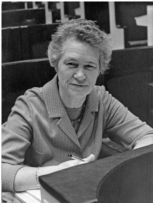
FIGURE 4.3 Politician and diplomat Inga Thorsson, a strong advocate of women's rights, nuclear disarmament, and international development, who sparked the Swedish initiative at the United Nations in 1967, leading to the convening of the Stockholm Conference five years later.

main thrusts (though perhaps not the acclaim of poverty) was shared by Thorsson, who also questioned aspects of patriarchal industrial society and its reliance on the unconstrained advance of technology. 34 Wägner, a study circle supporter teaching at a women's "folk high school" for rural women with little formal education and also a member of the Swedish Academy that awards the literary Nobel Prize, had become a controversial figure for her 1941 book. Not everyone liked its ideas of small-scale economics. It was heavily critiqued by Karin Koch, an up-and-coming economist who became the first female member of the Swedish government in 1949. "Does Elin Wägner want to take us back to a preindustrial society based on natural self-sufficiency, or not?" 35