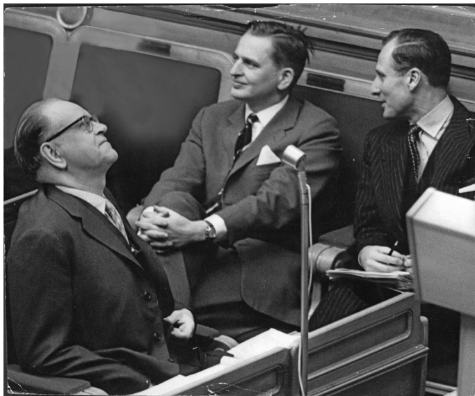
FIGURE 4.4 Swedish Prime Minister Tage Erlander (left), future Prime Minister Olof Palme (middle), and ambassador Sverker Åström (right), Sweden's permanent representative at the United Nations, in 1965. A political insider and major figure in shaping Swedish foreign policy during the post-war decades, Åström devised and implemented the diplomatic strategy that ensured the successful outcome of the Swedish initiative for an environmental conference under UN auspices.

The diplomatic strategy that was to unfold over the next twelve months was devised by Sweden's UN ambassador Sverker Åström (Figure 4.4), one of the most influential diplomats and shapers of