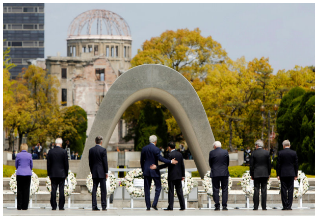
John Kerry and Kishida Fumio at Peace Memorial Park in Hiroshima, 11 April

There are mounting hopes that Barack Obama will use the occasion of the Group of 7 meeting in Japan in May to visit Hiroshima, and become the first American president to do so. It is remarkable that it required a wait of over 60 years until John Kerry became the first high American official to make such a visit, which he termed 'gut-wrenching,' while at the same time purposely refraining from offering any kind of apology to the Japanese people for one of the worse acts of state terror against a defenseless population in all of human history. Let's hope that Obama goes, and displays more remorse than Kerry who at least deserves some credit for paving the way. The contrast between the many pilgrimages of homage by Western leaders, including those of Germany, to Auschwitz and other notorious death camps, and the absence of comparable pilgrimages to Hiroshima and Nagasaki underscores the difference between winning and losing a major war. This contrast cannot be properly accounted for by insisting on a hierarchy of evils that the Holocaust dominates.