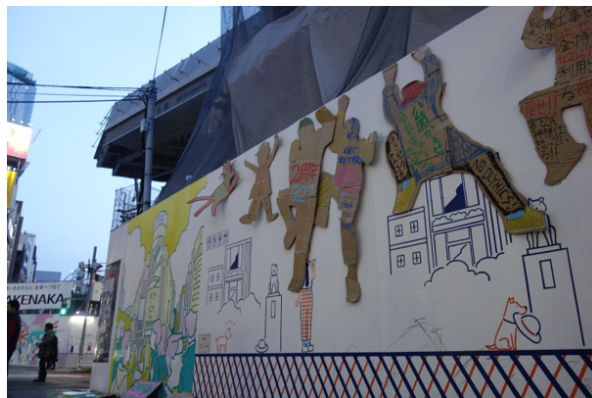
The Miyashita Park construction site hoarding was again “hijacked” in March 2019 with cardboard figures with anti-Olympics slogans.

shopping complex. Miyashita Park was another example, at one point its fencing decorated with a mural called “A day in the life [of] Shibuya” that presented Shibuya’s image of itself as a diverse and liberal place through a young girl’s encounters with the ward’s citizens (including a male same-sex couple, people with disabilities, and the elderly). It is a showcase of diversity but a very bourgeois one that has no room for the homeless or certain marginalized groups. In March 2019, activists from Miyashita Kōen Neru Kaigi protested the closure of the park and the coopting of the fencing to legitimize the gentrification in Shibuya by attaching their own cardboard figures decorated with messages. At a glance, these figures seemed to be climbing up the hoarding as if trying to get back inside the park. This tactic of adding cardboard art objects to fencing has been employed regularly by activists to protest park closures at night, not only Miyashita Park.