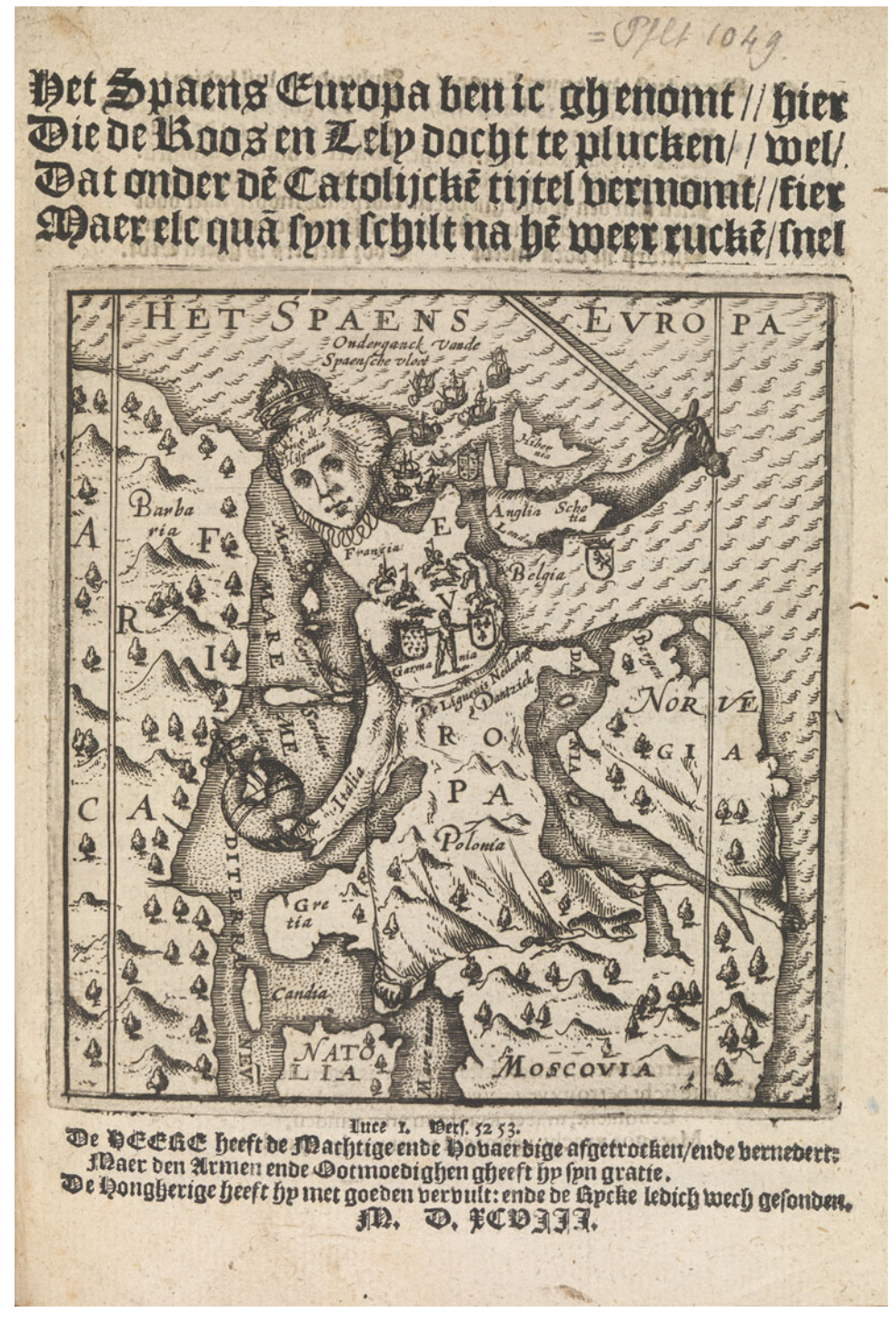
Fig. 5. Title page of Het Spaens Europa ben ic ghenomt . . . (1598).