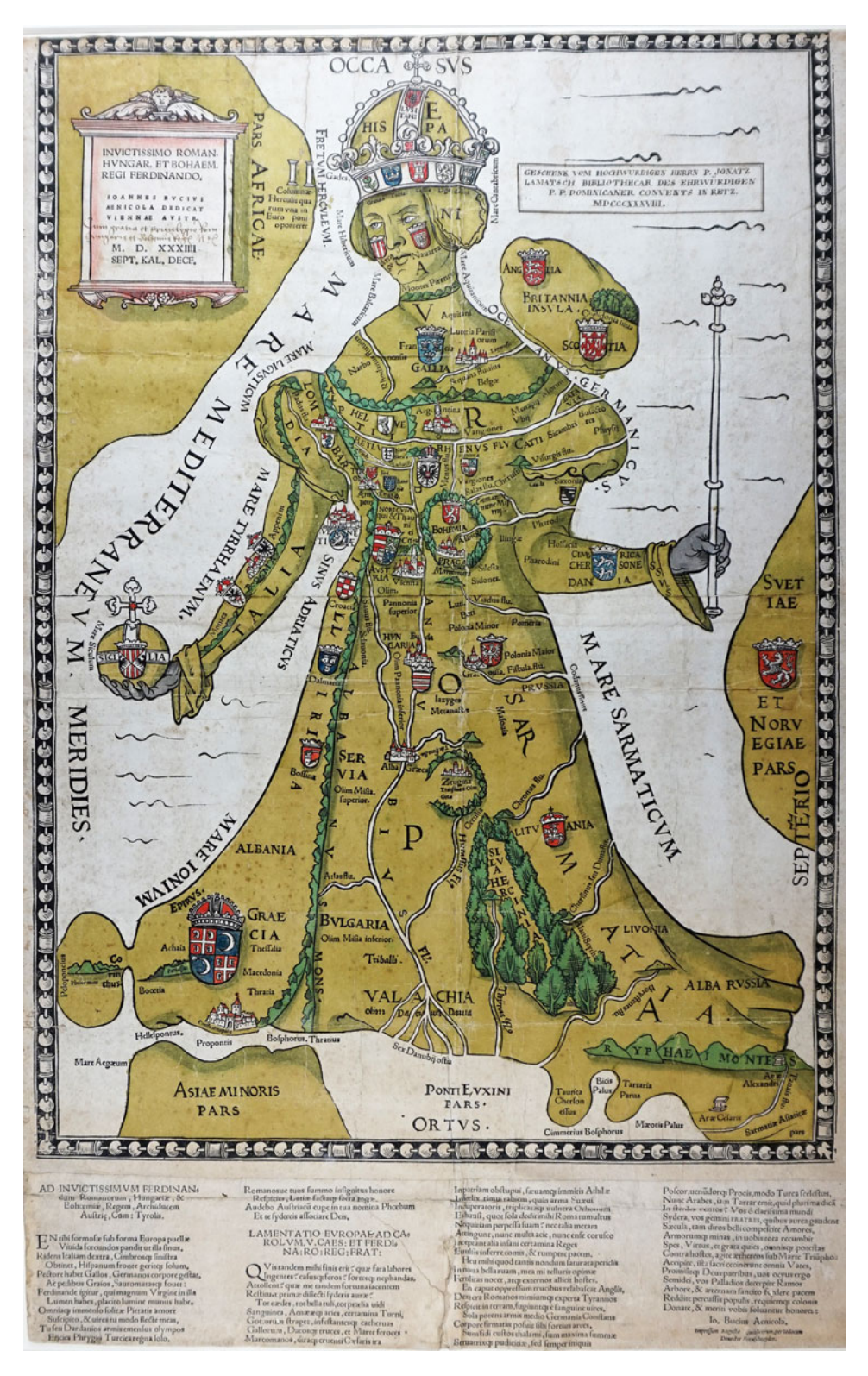
FIG. 2. Johannes Putsch's prototype of the genre known as Europa Regina (1534). Courtesy of the Museum Retz, Retz, Austria.