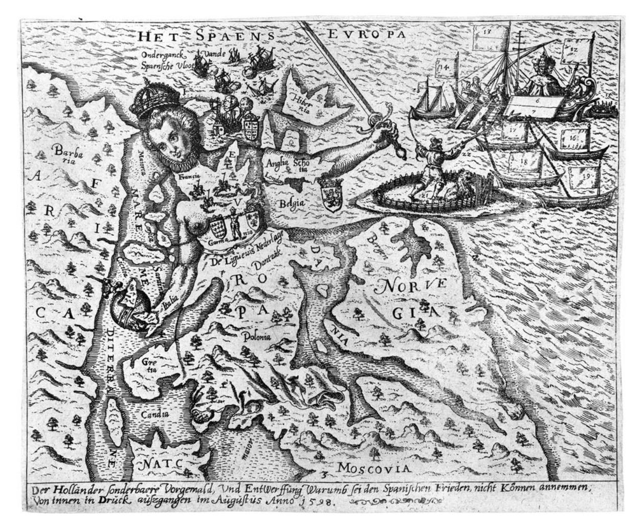
Fig. 1. The 1598 engraving widely known as Elizabeth I as Europa .

To an even larger extent, however, the mystery of Elizabeth I as Europa results from the engraving's presumed relationship to the famous English queen—an uproven presumption that has inevitably circumscribed the range of interpretations that could be brought to bear on the composition. Whether they understand the image as a power fantasy or a reflection of historical reality, scholars who identify Europa with Queen Elizabeth I deploy an English frame of reference, assume an English context of production. In short, they firmly inscribe the print within the horizon of England's national history. While this framework has enabled compelling