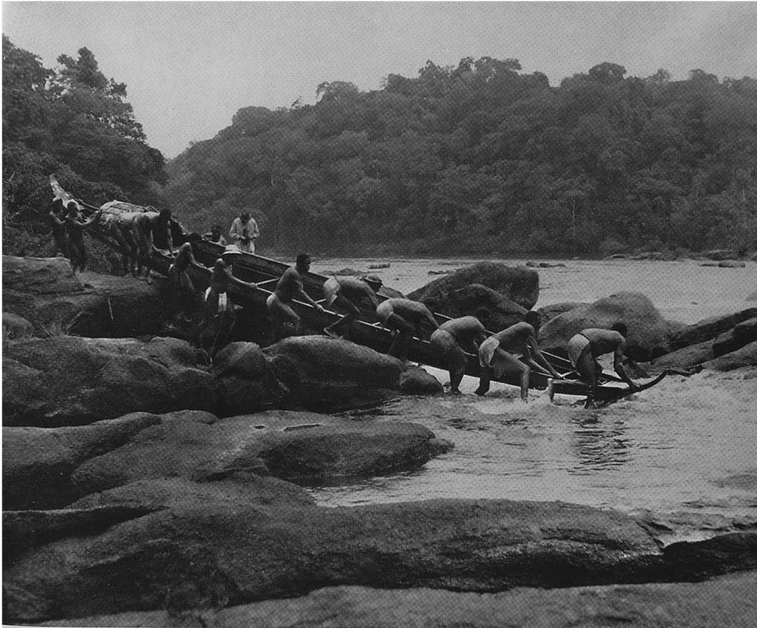
Figure 4. Maroons haul their large dugout canoes through the falls.