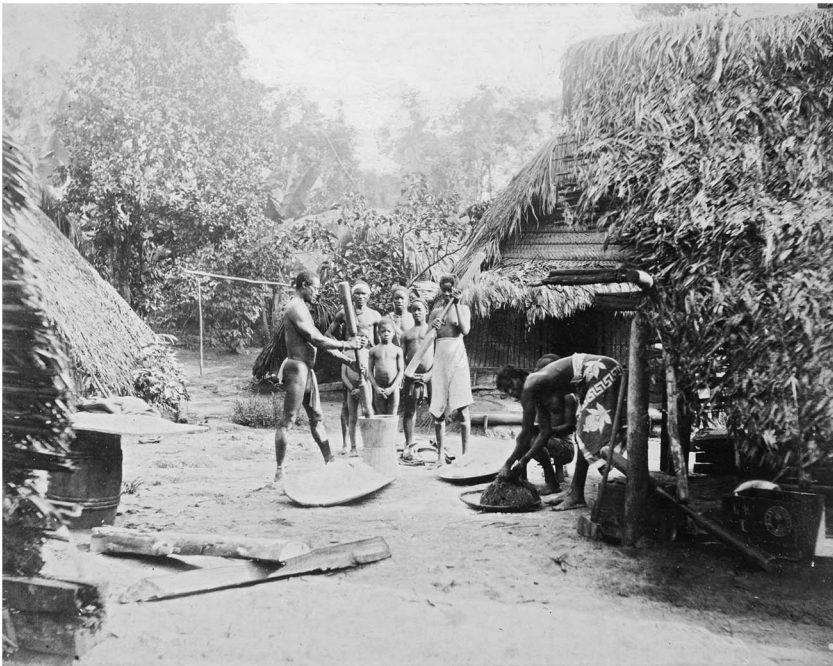
Figure 3. Okanisi preparing cassave, c.1885.

Coll.nr. TM-60012335.