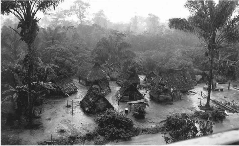
Figure 2. Maroon village by the Cottica river near Moengo.

Photograph: C.R. Singh. From: J.L. Volders, Bouwkunst in Suriname (Hilversum, 1966) .