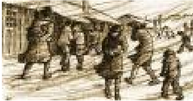
Estelle Ishigo's drawing of an internment camp.

His film, "The Mushroom Club," was nominated for an Oscar in 2005 for best documentary short subject. It is a personal look at how hibakusha live with the emotional and often physical scars of the bombing while the significance of the devastating attack has faded in the minds of Hiroshima's younger generations.