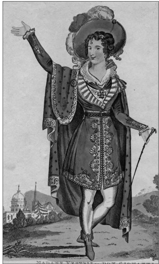
Figure 1. ‘Tuppence-coloured’ portrait of Eliza Vestris as Don Giovanni, published by Orlando Hogson, c. 1831–33.

The presence of signs indicating different gendered identities produces a fluid sensuality. Such images concur with Leigh Hunt’s observation on reviewing her portrayal of Macheath in John Gay’s The Beggar’s Opera : ‘In a word, we ever remember an instance of an actress who contrived to be at once so very much of a gentleman, and yet so entire and unaltered a woman.’ 13 This ambivalence is also present in the text of the memoir, which, like the other volumes constituting Oxberry’s Dramatic Biography and Histrionic Anecdotes , voices a concern with women’s moral behaviour. 14 The author mixes fascination for her accomplishment and charms