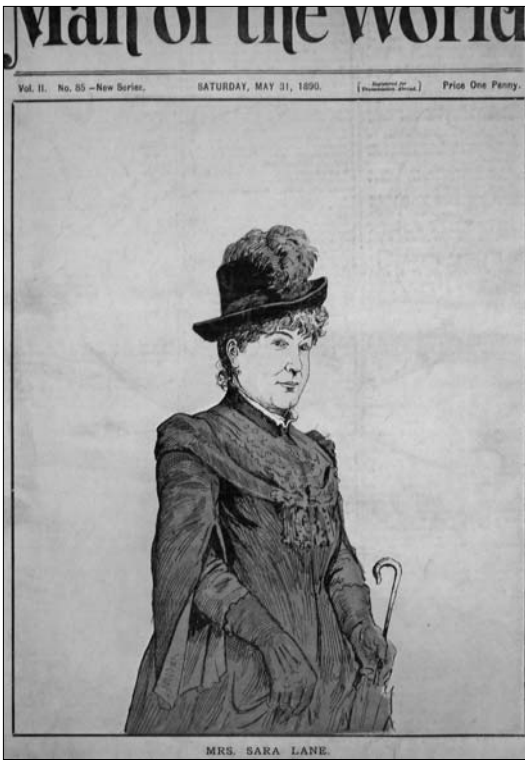
Figure 10. Lane on the cover of the weekly newspaper, Man of the World , 31 May 1890.

subject looks businesslike. The accompanying text shows that the readership is not expected to have visited the Britannia and introduces the manageress as its 'presiding genius'. 61