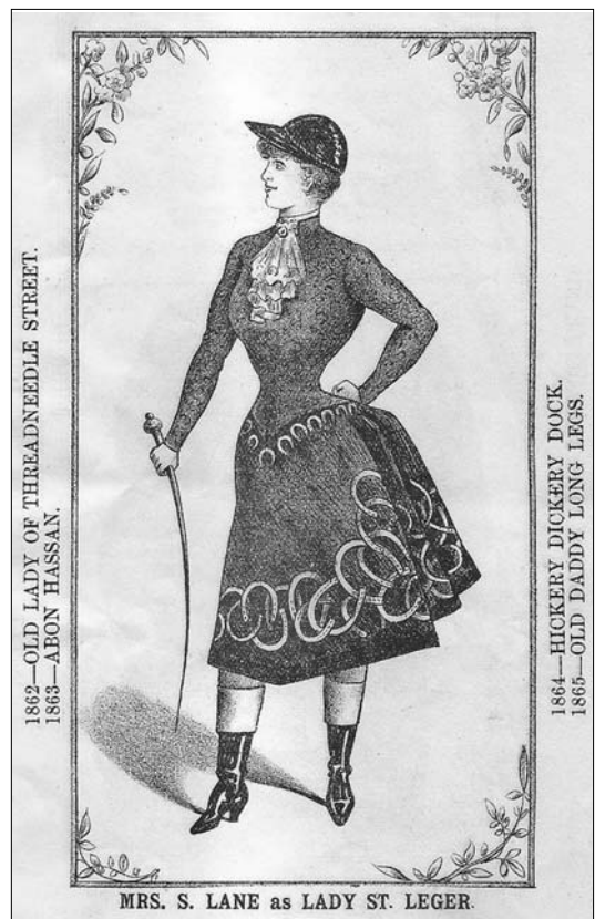
Figure 9. Programme illustration of Lane as Lady St. Leger in the 1886–87 Britannia Theatre pantomime King Tricke; or, Harlequin The Demon Beetle, the Sporting Duchess and the Golden Casket .

While Robinson is right in relation to the actress-managers she mentions, the iconology of Sara Lane does not fit this description. Take, for example, Lane's appearance on the cover of the 31 May 1890 edition of the Man of the World (Figure 10, overleaf), a periodical from the same publishing stable