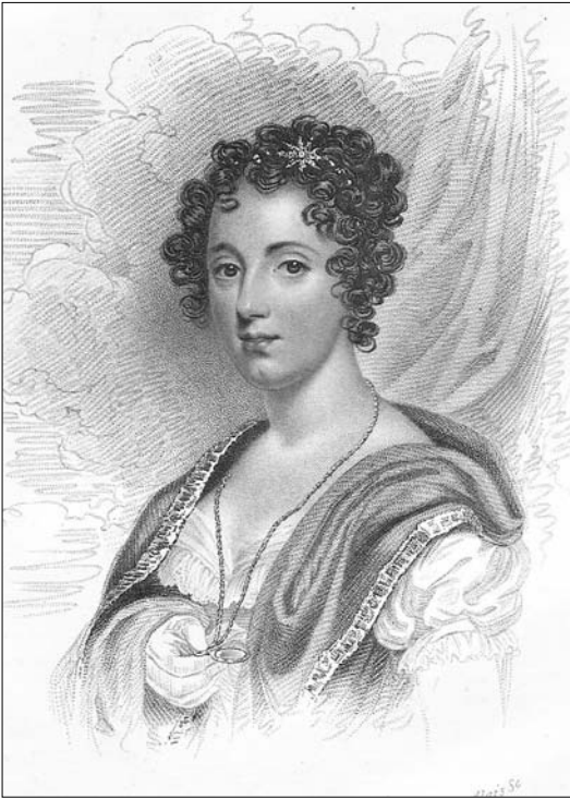
Figure 2. Portrait of Vestris by Rosa Emma Drummond in an engraving by Woolnoth as it appeared in La Belle Assemblée , July 1820. Author's collection.

Suggestions of luxurious living are also present in an early offstage picture of Vestris (Figure 2) that circulated alongside the cross-dressed images. It is based on a painting by the miniature artist Rose Emma Drummond (alleged to be the model for Miss La Creevey in Dickens's Life and Adventures of Nicholas Nickleby ). 16 Published in the monthly periodical La Belle Assemblée in July 1820 in a series of 'biographical sketches of illustrious and distinguished characters', a glamorous Vestris appears in what Clifford John Williams identifies as fashionable Parisienne style. 17