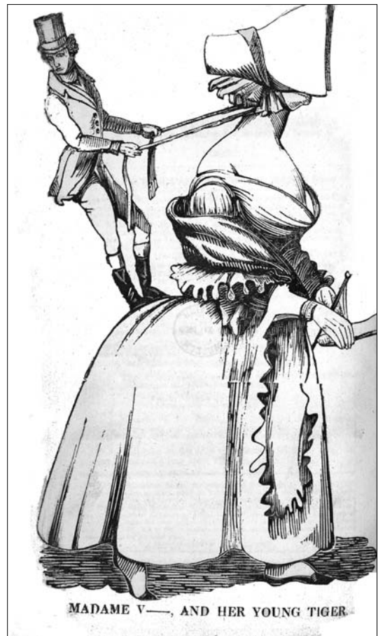
Figure 5. Illustration of Vestris and her husband, Charles Mathews, from Memoirs, Public & Private Life, Adventures, and Secret Amours of Mrs C.M. Late Mad. V. of the Royal Olympic Theatre (London: J. Thompson, n.d.).