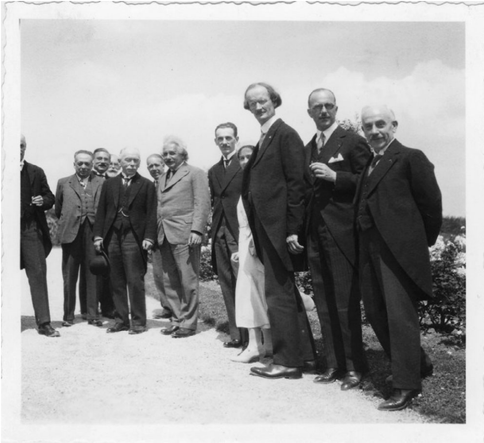
Figure 3. Group portrait in Belgium in 1932, made by Belgian King Albert I, including, among other prominent physicists and the Belgian Queen Elisabeth, Théophile De Donder (first from right) and Albert Einstein (sixth from the right).

Belgian physicists. Nonetheless, in the years before, many among them had attempted to contribute to relativity physics. Apart from the considerably well-known Belgian contributions of De Donder and Lemaitre, more than twenty other Belgian scholars published on relativity during the first half of the 1920s (see fig. 1, above).