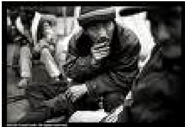
Japan's new homeless

The unemployment rate, which mostly fluctuated between 2-2.5% during the 1980s rose to 5.5% by the end of 2001; the suicide rate, traditionally higher in Japan than in Europe or North America, increased from 16.4/100,000 in 1990 to 25.5/100,000 by 2003 (Statistics Bureau 2005). And even greater changes are about to unfold: in 2007 the first large cohort of elderly baby boomers will launch the country's mass retirement wave (typically at age 60); at the same time, increasing numbers of young people (already more than one million) have opted out of the labor market. This NEET generation (not in employment, education or training), which prefers hanging out in strange clothes and hairdos, can be seen as a sign both of Japan's national decline and its personal affluence.