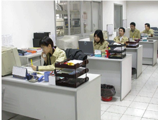
China's new industries

and before this wave is exhausted the country's manufacturing may dominate the global market of common consumer items as thoroughly as it now dominates Wal-Mart's selection.