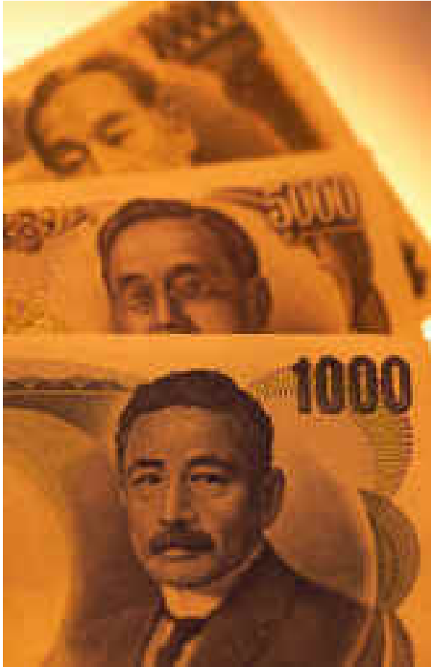
The value of the Yen spiraled following the Plaza Accord

As Japan's high-quality exports kept rising, Ezra Vogel (Harvard's leading expert on Japan) published a new edition (1985) of his seemingly prescient bestseller (it first appeared in 1979), Japan as Number One . Japan's expansive trend actually defied the revaluation of yen and accelerated during the next four years: the Nikkei index stood at just over 13,000 by the end of 1985 and it peaked at nearly 39,000 in December 1989. But right afterwards Japan's bubble economy burst in spectacular fashion (Wood 1992; Baumgartner 1995). History has no other example of a country whose standing switched so rapidly from that of a globally admired technical and manufacturing superpower to that of a deeply ailing, has-been economy.