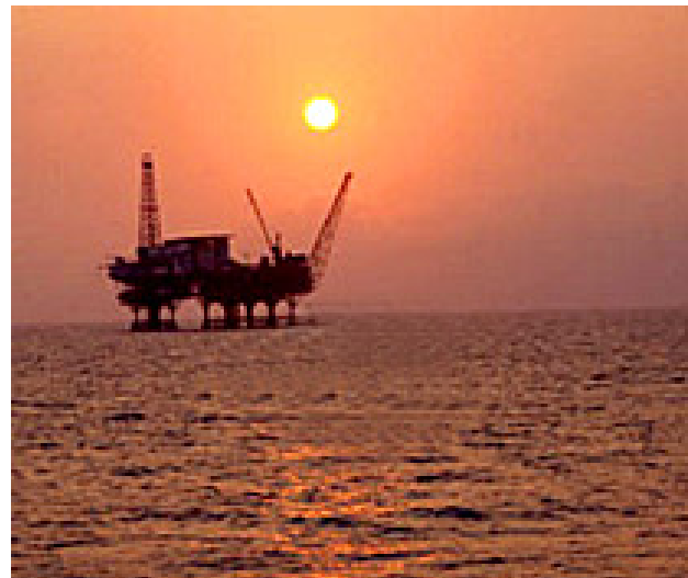
China's National Overseas Oil Company

rural labor force and as its exports came from traditional labor-intensive categories in mature manufacturing sectors. But since the late 1990s China has become aggressive in a global quest for raw materials in general and for oil in particular (Zweig and Bi 2005). Chinese are ready to deal with Australian liquefied natural gas traders, Tehran's mullahs, or the Sudanese instigators of Darfur atrocities who control large untapped reserves of crude oil. Many commentators see the flood of China's manufactured products as an entirely welcome trend (they keep Western inflation rates low!), and many CEOs speak favorably about America's strategic partnership with China.