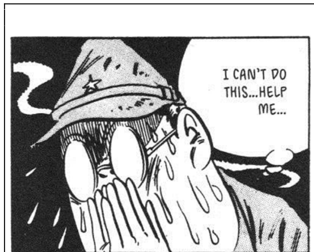
Soldier Mizuki in mortal fear on the battlefield in Papua New Guinea (Mizuki Shigeru's manga history of Shōwa Japan)

become more chilling than thrilling and the soldiers become more pitiful than brave. For hundreds of pages, readers wading through graphic illustrations of men falling and dying – in Leyte, Guadalcanal, Imphal and elsewhere – can recognize the protracted despair. There is no exhilarating valor. 26