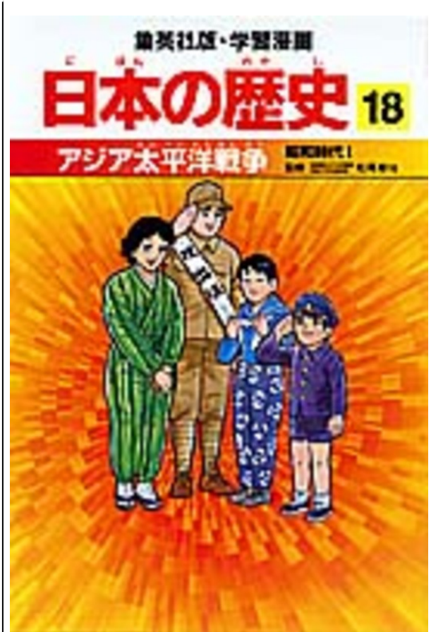
The Asia-Pacific War (Shueisha's manga history of Japan)

No heroes make their mark in these academic study manga, but a few villains make unceremonious appearances. None of these villains are American, Chinese, Russian, or anyone else in the enemy camp; they are all Japanese. The designated “bad” characters are Japanese men who advocated, instigated, promoted, and then bungled the war. Such “war mongers” are usually officers of the Japanese Army, especially those in the Kwantung garrison in Manchuria and the high military and state leadership who backed and covered for the rogue Army. These loaded characterizations produce a vernacular understanding of Japan's colonial war on the continent in young readers who develop an early moral awareness of “something gone terribly wrong in Japanese history.”