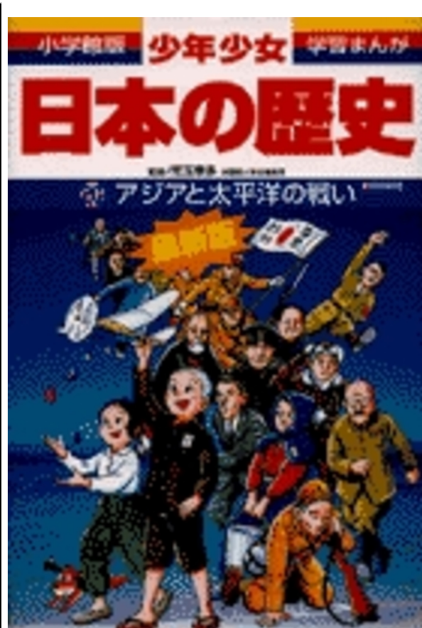
The War in Asia and the Pacific (Shōgakukan's manga history of Japan)

For the most part, the academic manga offer colorful portrayals of 2000 years of Japanese history from early settlement through the contemporary era in chronological order. The portrayal of the Asia-Pacific War usually takes up one volume, averaging about 150 pages in length. As a portrayal of a discredited and disastrous war, there are no gallant national heroes or enchanting political leaders that brighten up the pages and dramatically drive the plot. Instead, the stories unfold with accounts of divisive politics and deteriorating economic life that are rife with social conflict, unstable government, ambitious military, terrorist violence, rogue actions, and rampant poverty. These accounts are interspersed with descriptions of bloody violence, oppression, and massacres, which, in turn, lead ultimately to crushing defeats, mass deaths, and the devastating national fall.