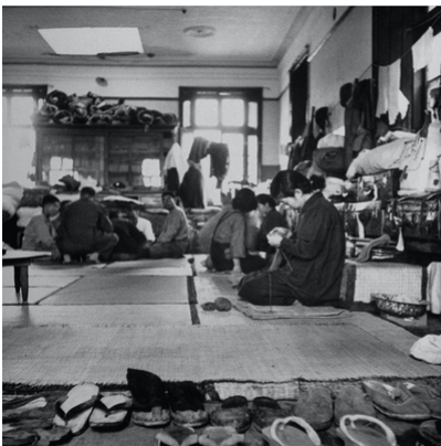
Waiting for repatriation in temporary quarters