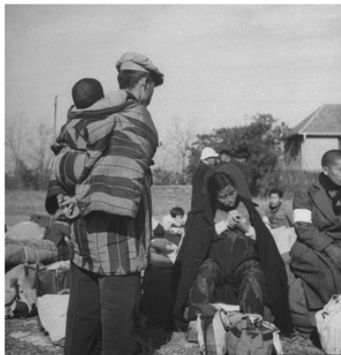
Waiting for departure