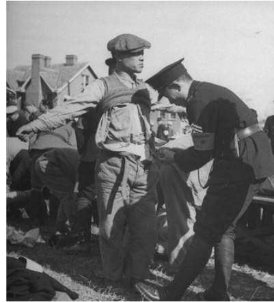
Pre-embarkation check

Viewed in this light, GMD policy unambiguously labelled all civilian repatriates as perpetrators of Japanese imperialism, the same rationale behind the GMD's requisition of Japanese civilian assets as discussed above. In a sense, these policies ran counter to Chiang Kai-shek's original idea of "differentiating the innocent Japanese people from the militarists."