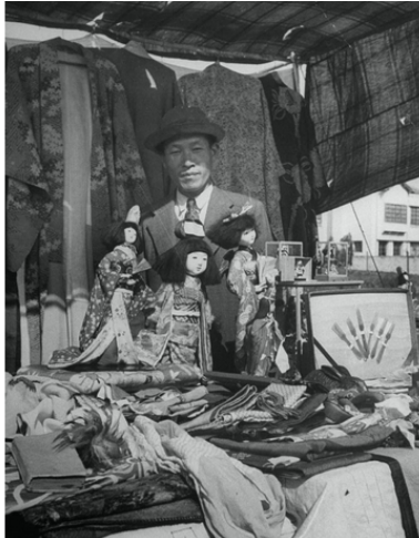
Selling off possessions

Anxious to limit intermingling between the Chinese and Japanese, the GMD authorities once considered enforcing a ban on such selling and peddling. However, under the double pressure of the active lobbying of the JSGC and the gradual draining of relief resources, the SJNMO backed down. Sellers were allowed to continue their business as long as they properly registered and operated within designated areas.