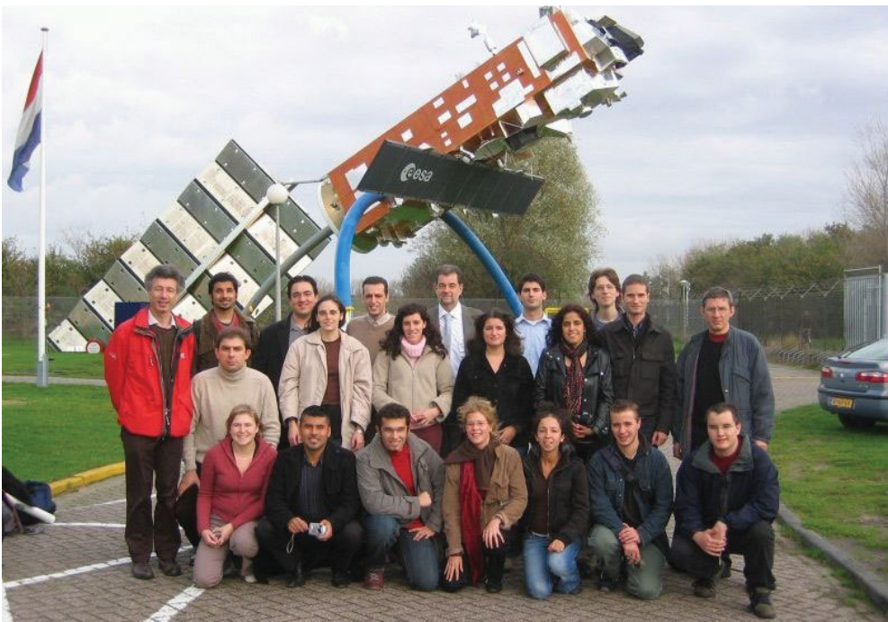
Figure 3. OSAE students visiting ESTEC, the European space research and technology centre.

The degree benefits from the experience and skills of the partners which are involved in the most recent and largest projects in astronomy (e.g., CoRoT, Planck, Herschel, Mars Express, Rosetta, JWST, Bepi Colombo, NAOS/VLT, OHANA, VISIR/VLT, ...). Due