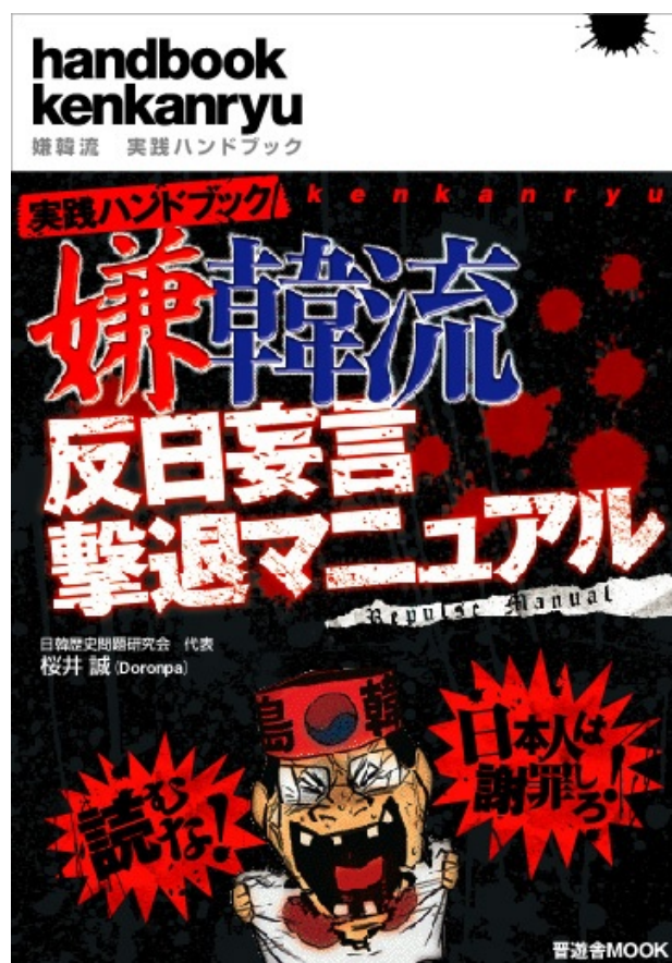
‘ Kenkanryu Practical Handbook ’