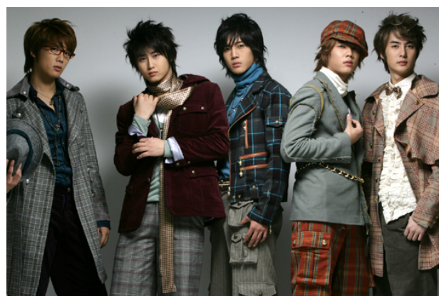
Pop Idols of the Korean Wave

popularity of a Korean TV drama, Winter Sonata , among Japanese, notably among, but not limited to, middle-aged women. As Japan's mainstream media regularly reported, interest in popular cultural products from Korea quickly spread, leading to growing overall interest in Korea. Fans traveled to Korea, signed up for Korean language courses, and learned about this 'near but far' neighboring country which Japan had once colonized. Optimism was expressed that this new Japanese fascination with things Korean might help ease the political tensions between the two countries with a troubled past. Kenkanryu , in the most immediate sense, is a critique of the popularity of the 'Korean Wave'. Yamano maintains that the Korea boom was a creation of the mass media and that the anti-Korean sentiments which had been rife amongst Japanese internet users, he claims simply to have made available in manga form. Yamano's position seems to be that those who find Korean popular culture attractive, fashionable, cool and hip, do not know the 'true' Korea, and his comics shows the 'other side' of Korea. Japanese bloggers and BBS posters who support Kenkanryu , too, often regard the comic as the antithesis of the Hanryu boom 'media-creation', and look down on those consumers who simply went along with the trend (themselves following the opposite trend).