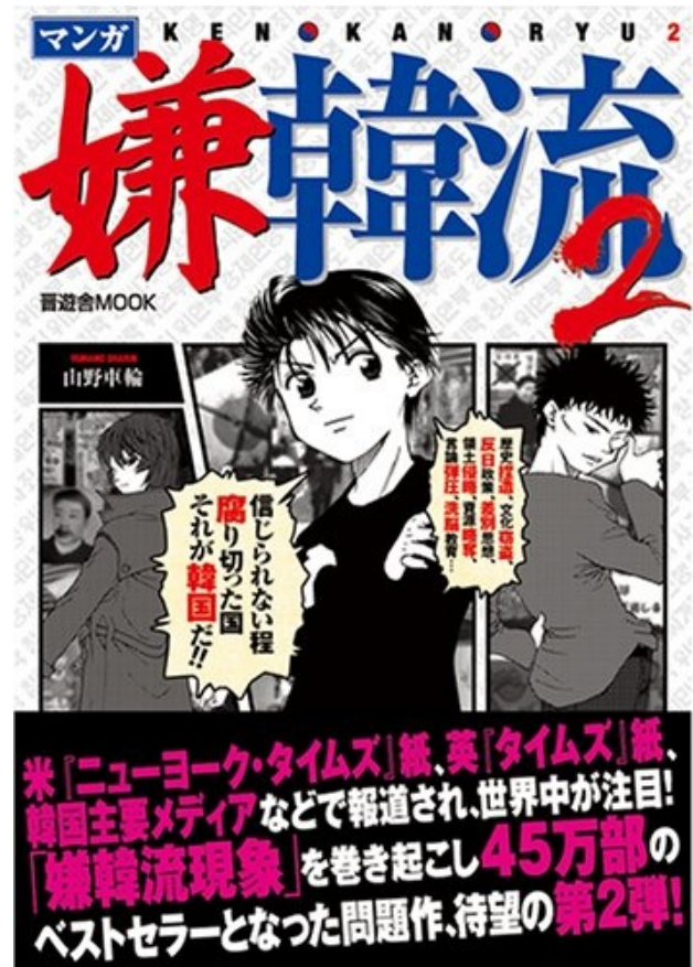
Kenkanryu vol. 2 cover

historical distinctions. Rarely differentiating between Korean administrations, citizens, culture, or business, Kenkanryu creates an impression that a large number of disparate issues—Korea’s claim to Takeshima/Dokdo Island, fishing boats entering Japanese waters, a children’s anti-Japanese art exhibition, imitation snack food, zainichi ‘privileges’, the conflict between Korean and African-American communities at the time of the Los Angeles riots, the adoption of hangul, and the stem cell cloning scandal—all emanate from and exemplify the negative essence of Korea. A given fact presented in the book may or may not be true, but when compiled together and presented as the whole ‘truth’ of ‘Korea’, the result is a work that fundamentally caricatures and distorts the nature of South Korean society. Complex issues are repeatedly reduced to and sensationalized in a few provocative phrases. This is shown in the cover of volume 2: ‘fabrication of history, theft of culture, anti-Japanese policies, discriminatory thinking, invasion of territory, plundering natural resources, suppression of freedom of speech, brain-washing education ... An unbelievably rotten country, that is Korea!!’