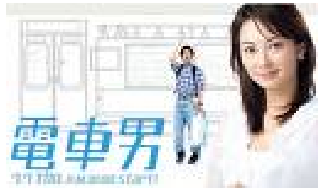
Densha Otoko (Train Man)

The mass media itself quickly caught onto this, printing the story about how the anti-Korean wave had been ignored by the media. In this rather ironic way, something that the mainstream media had been ignoring became news within the media that was 'ignoring' it. Meanwhile those who were shocked by the Kenkanryu boom attacked it, raising its profile in the media. Any publicity is good publicity, and the participation of the mass media with a much larger audience consolidated the comic's status as a bestseller. As in the case of Densha Otoko (Train Man), [12] an internet-originated 'boom' may be made into a national phenomenon with the intervention of mass media. With Kenkanryu , too, media did much more than simply report an event that had already taken place. Media actually contributed to creating 'reality' by bouncing around information of added value, and simply by increasing the number of appearances of Kenkanryu in the public arena. Ironically both the love and hate of Korea (Korean Wave and Hate 'The Korean Wave') took place in the same context of commercialism, marketing strategies, and media effects.