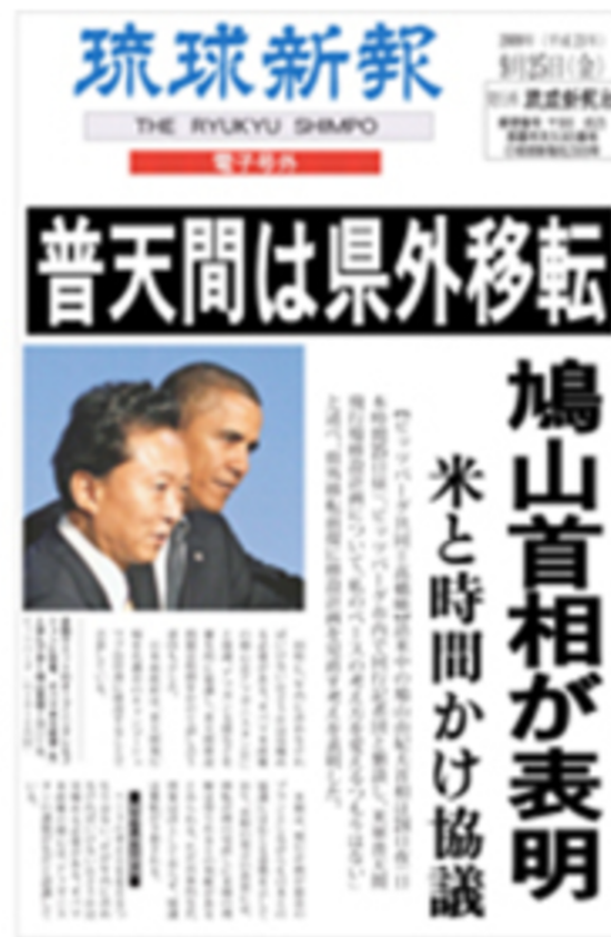
Hatoyama informs Obama of the Kengai Isetsu Policy

Hatoyama’s proposition instantaneously thrust kengai isetsu as an intelligible political claim into public consciousness. Which governor of a Japanese prefecture, he asked, was willing to accept a US military base in place of Okinawa? 16 Due to the disproportionately small number of US military bases in Japanese prefectures other than Okinawa, few Japanese politicians or citizens had directly confronted the meaning of the US-Japan Security Treaty. However, with Hatoyama effectively dropping the base problem on each governor’s doorstep, many citizens were forced to confront the reality of the Treaty from which they benefit. Are you willing to pay dues for the US-Japan Security Treaty rather than continuing to exploit Okinawa Prefecture by imposing 75% of the burden there?