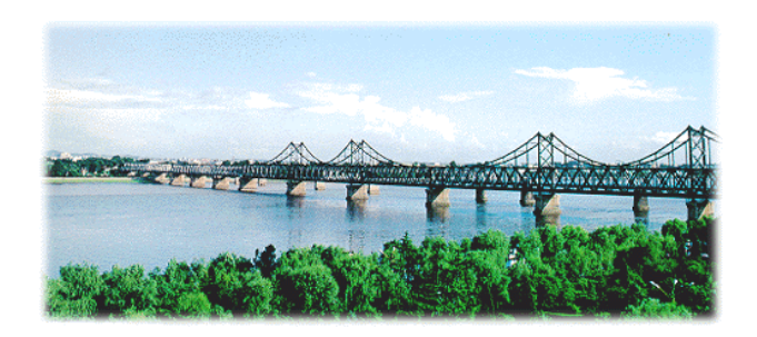
The China-Korea Friendship Bridge

Trucks rumbled across the China-Korea Friendship Bridge spanning the river. About 70 percent of trade between the two countries is said to move through Dandong.