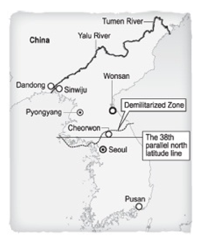
A Divided Korea and the Chinese border

In September 1945, the United States and the Soviet Union established the 38th parallel to demarcate their respective zones of control on the Korean Peninsula. The 38th parallel became the de facto North-South border when Korea was officially split in 1948.