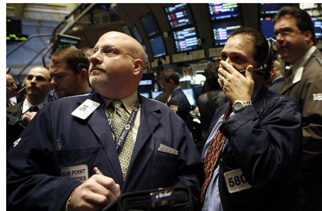
The stock market in free fall in October-November, 2008

international monetary system is in big trouble.