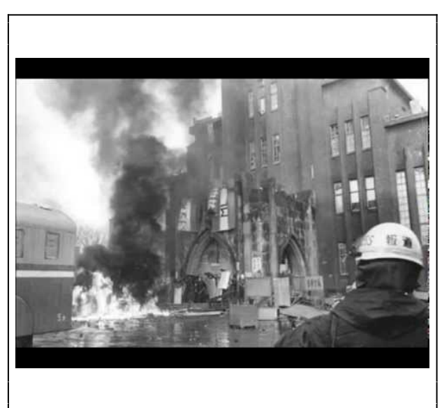
Yasuda Hall, the University of Tokyo, under siege in 1969.

Despite the great variety of events that were eventually encompassed in popular understanding of the symbolic events of "1968" underlying all of them were the powerful visual images disseminated through new media, above all TV, that spread rapidly throughout society in Japan and many other countries in the 1960s.