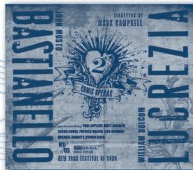
TWO NEW COMIC OPERAS John Musto: Bastianello William Bolcom: Lucrezia BRIDGE 9299A/B