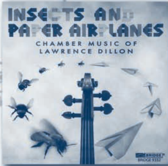
LAWRENCE DILLON string quartet & piano BRIDGE 9332