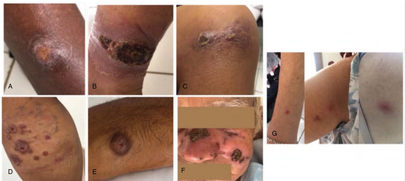
Figure 2. Leishmaniasis lesions. (A) L. braziliensis , localized form on the leg. (B) L. braziliensis , localized form on the posterior part of the leg. (C) L. braziliensis , disseminated form throughout the body. (D) L. braziliensis , disseminated on the arm and forearm. (E) L. braziliensis , localized on the arm. (F) L. braziliensis , mucocutaneous form on the face and nasal mucosa. (G) L. infantum lesions.

The time of evolution of ATL symptoms determines the severity of the disease. Delays in diagnosis and treatment initiation may