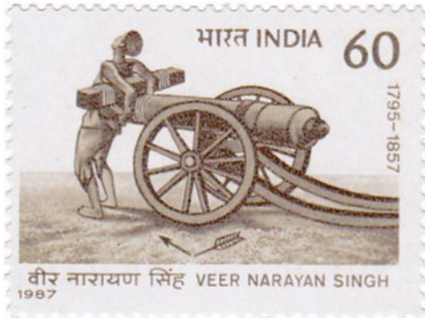
Figure 4. A 60-paise commemorative postage stamp depicting the execution of Veer Narayan Singh, issued by India in 1987.

the condemned and terrorised onlookers into submission. For these reasons, the method was adopted by many regimes: in Persia, it served largely as a heavy-handed punishment to deter crime; in India, execution by cannon was a fearsome implement of both native and colonial control; and, in Afghanistan, the practice became a barbaric tool for state-building. Although almost all contemporary English-language scholarship focuses exclusively or primarily on British practice, this article has demonstrated that this limited view overlooks important historical uses in other states and by other rulers.