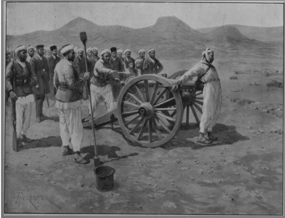
Figure 3. A spy being blown from the noon-day gun at Sherpur Cantonment, outside Kabul, in 1905.