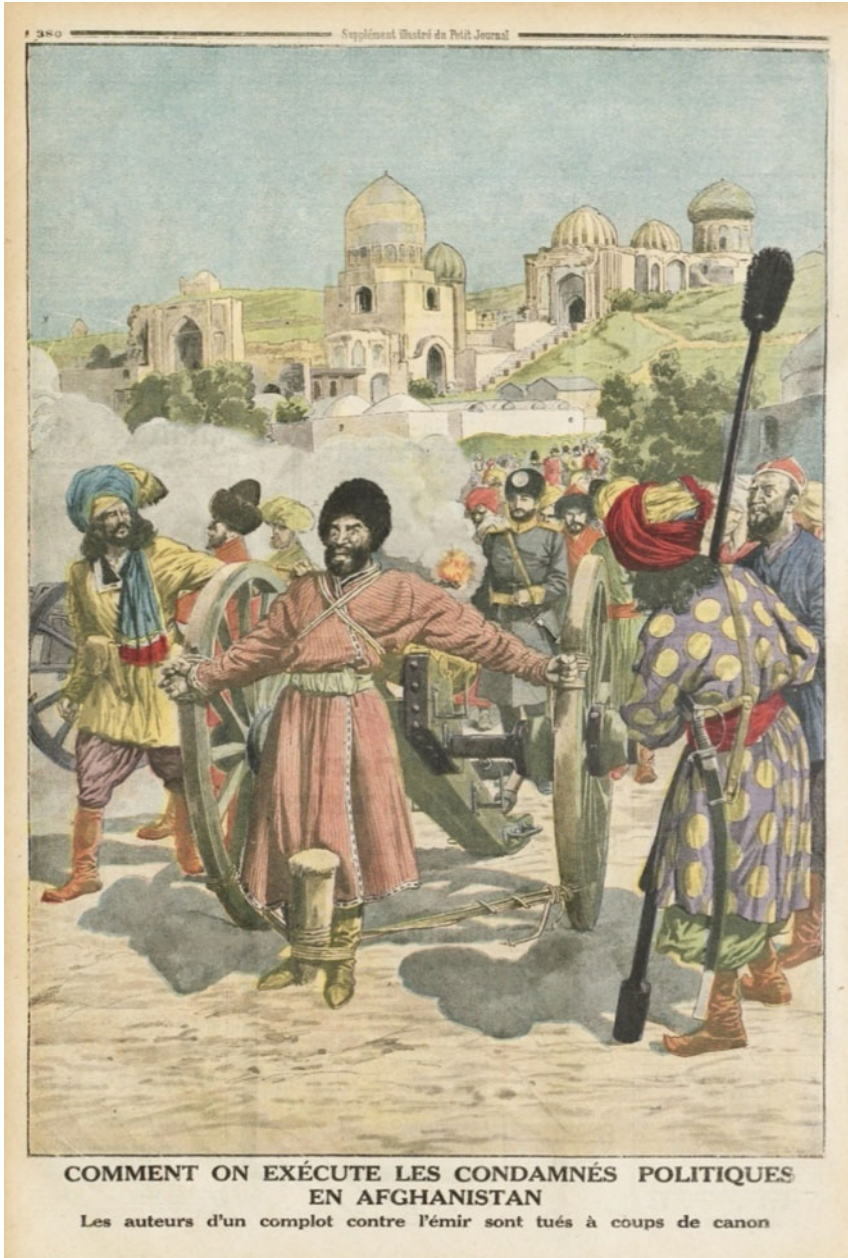
Figure 1. A full-page illustration that appeared on the back page of the illustrated supplement to Le Petit Journal of 23 November 1913. The caption reads: ‘Comment on execute les condamnés politiques en Afghanistan’ (‘How political convicts are executed in Afghanistan’); ‘Les auteurs d’un complot contre l’émir sont tués à coups de canon’ (‘The perpetrators of a plot against the Emir are killed by cannon fire’). Emir Ḥabībullah Khān is visible in the front row of the crowd, over the condemned man’s left shoulder. Note how the prisoner is bound in several places: to each wheel of the gun carriage, to a post in the ground, and around his body to the muzzle of the cannon itself. Source: Le Petit Journal , ‘Comment on execute les condamnés politiques en Afghanistan’, Supplément Illustré, 23 November 1913, p. 380. Please note that this image has been lightly edited for clarity.