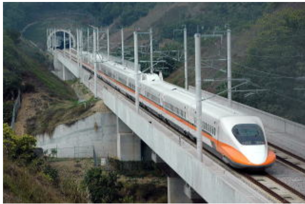
High speed train in Taiwan

further ammunition to the European consortium's legal case. But there is a concern that some alterations could lead to problems. For this reason it is rare to find a Japanese spokesperson alluding to the 'Taiwan Shinkansen' today, referring instead to the 'Taiwan High Speed Railway'.