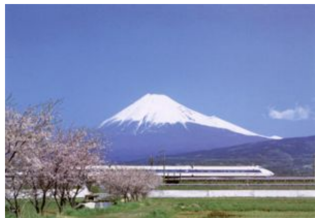
Mt. Fuji and Shinkansen

The Shinkansen is one of Japan's iconic symbols. The image of Mount Fuji with a passing Shinkansen is one of the most projected images of Japan. The history of the Shinkansen dates back to the Pacific War. Shima Yasujiro's plan for the dangan ressha ('bullet train') then included the idea of a line linking Tokyo with Korea and China (1). Although that plan never materialised, the Shinkansen idea was reborn nearly two decades later, as yume-no-chotokkyu ('super express of dreams'), with Shima Hideo, son of Yasujiro, among the key figures in its development (2).