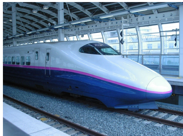
E2-1000 series shinkansen

Suddenly, in September 2004, a small announcement declared that the Shinkansen bid had won, albeit a scaled down version of the original plan. This led to protests concerning the failure to hold a public hearing before the decision. But this time, the Chinese government shut down a website dedicated to the protests. Japan is to provide the train equipment - and a limited amount of that. The trains will be a modified version of JR East's E2-1000 series sets made up of 8 carriages. Just 3 sets are to be made by Kawasaki Heavy Industries, while 57 more sets are to be made in China by Nanche Sifang in Qingdao working with Kawasaki. The issue of Chinese production of the trains, that is transfer of the technology, is crucial to the Chinese calculus. The trains will be white and blue - similar to the Shinkansen used by JR Central on the Tokaido Shinkansen. So while one will be able to see Shinkansen-like trains in China, this is not the Shinkansen system, so again it would not be appropriate to use the word in connection with China's high speed line.