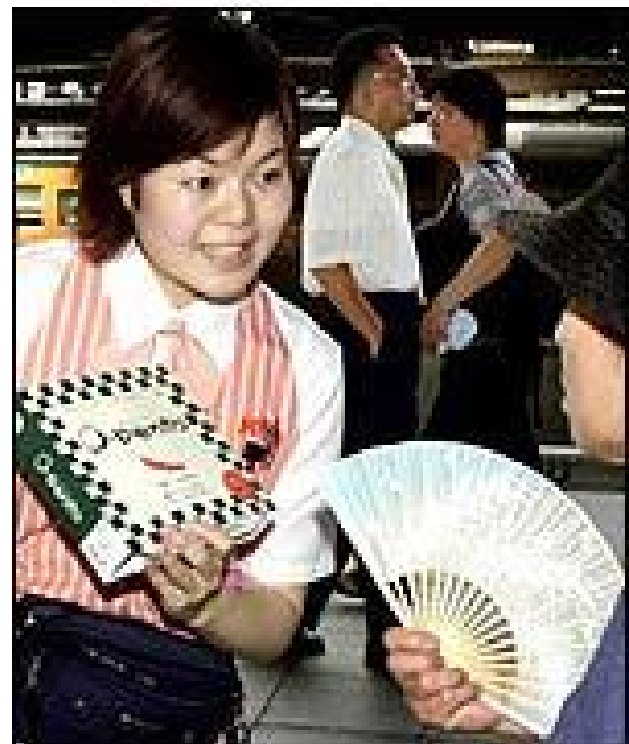
Ekiben (lunch boxes) on sale on the platform

Shinkansen, then, is not simply a bullet train; it is an entire system spanning and transforming the Japanese archipelago. Indeed, ‘Shinkansen’ literally refers to the line, not the train, although it has come to mean the train also. You cannot just put a bullet train on a railway line in another country and expect it to work to Japanese standards. Railroad bed and tracks must be designed to house the bullet train. Although it runs on ‘standard gauge (width)’ rails, the body is larger than that of trains found on most standard gauge railways around the world and precise technical specifications are critical to its ability to negotiate high speeds securely.