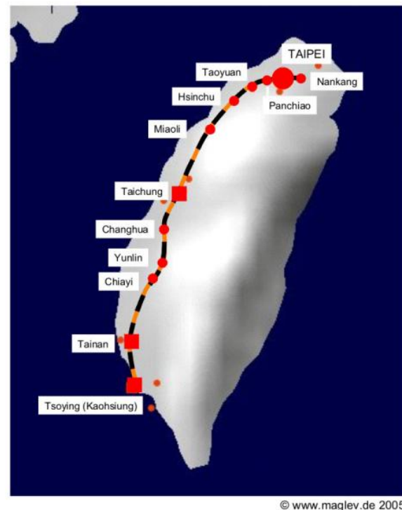
Route of Taiwan's High Speed Railway

Many anticipate that the new line will turn Taiwan into one large metropolis. Comparisons are often made between the line and the Tokaido Shinkansen linking Tokyo and Nagoya. The length is comparable (345km compared with 342km) and the number of stations similar (12 compared with 13 at present on the Tokaido Shinkansen (7)).