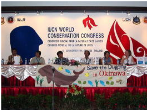
IUCN World Conservation Conference

Japanese government's EIA. The representative of the US Department of the State refused to accept the draft, arguing that the US government could not intervene in the matters of a "sovereign state." The final and compromised version of the recommendations urged the US government to "cooperate, if requested, in the environmental impact assessments carried out by the Government of Japan for military base site construction." [20] To date, however, there has been no sign that the Japanese government has asked the US government and military to do so.