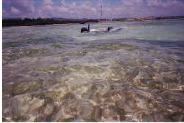
The dugong habitat with Camp Schwab in the background

The Japanese government appears committed to the construction of the base at Henoko and prepared to deal with any criticism while international interest in the environment of Henoko has risen.