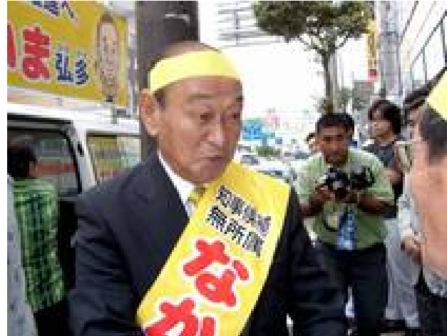
Nakaima Hirokazu on the campaign trail

For the next four years, many expect Okinawa's new governor, Nakaima, the former chairman of the Okinawa Electric Power Company, to follow many Japanese government's policies, notably the controversial plan to replace the US Marine Air Station at Futenma with a new US base at Henoko, Nago city, in the north of the island, in waters still relatively unspoiled which also constitute crucial habitat for the endangered dugong species.