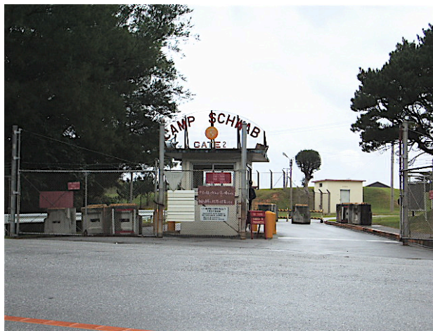
Entrance to Camp Schwab

was created by the US government and military and the Japanese government in 2001 as the “sole source of guidance for environmental compliance, requirements, regulations, and standards for DoD activities and installations in Japan.” [24] The JEGS recognizes the dugong as an endangered species. The coalition is also examining the implications of Final Report: Task 5 Cultural Historical, and Archeological Documentation, MCB Camp Smedley D. Butler and MCAS Futenma, Okinawa (1993) published by the US military. [25] The report documented the results of examination of documents and surveys on archeological, cultural and historical resources of Okinawa in relation to US bases on the island of Okinawa. It recognized the existence of cultural assets with scientific value in Camp Schwab, where the construction of the new base is planned.