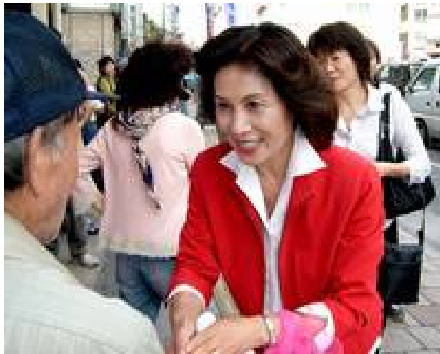
Candidate Itokazu Keiko

Itokazu's campaign was also seen by many as notable for anti-base rhetoric but weak on economic issues. While her anti-construction stance was well received by her supporters, she was unable to articulate and deliver an economic program to the wider public. Her pledge to transform the important but ailing construction industry into a sector that would shift its focus from wasteful and environmentally damaging public work projects to works that would help revive Okinawa's degraded environment was not clearly explained. Struggling to survive as they are at present, many construction firms and their large labor force were not ready for such drastic changes. [3]