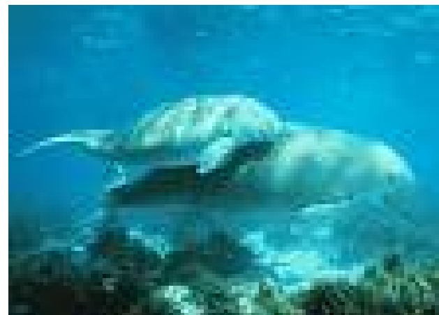
The dugong at sea