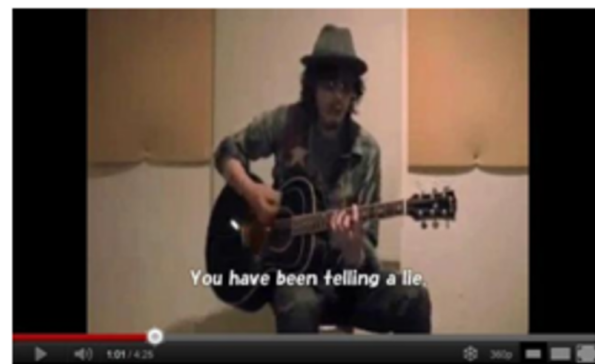
Saito Kazuyoshi's song, with English subtitles ( LINK to view video)