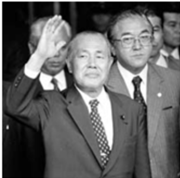
Tanaka Kakuei (1918-1993)

Following in Shoriki and Nakasone's footsteps as the standard bearer for nuclear power was former prime minister Tanaka Kakuei, famed for his Plan for Remodeling the Japanese Archipelago.