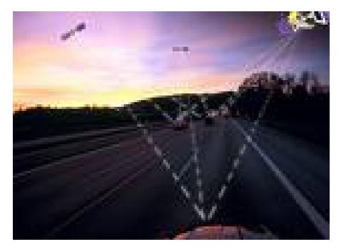
Galileo Global Navigation System

It is noteworthy to underscore that the defenserelated justifications for Galileo have been downplayed by the E.U. institutions. The E.U. institutions have highlighted the economic benefits of a G.N.S.S. Requested by the E.C., the consultancy company Price Waterhouse Coopers drew a business plan for the Galileo project, which was submitted to the European Council of Ministers. According to this study, by involving private sector actors, Galileo "should generate revenues for the operator rising from some 66 [million euros] in 2010 to over 500 [million euros] in 2020." Definitively, Galileo would create a "virtuous cycle" through a spin-off effect in several sectors of the European economy. Moreover, Galileo has been portrayed as an instrument to create thousands of jobs and as a way to avoid the brain drain in the realm of aerospace, aeronautics and satellite industries.