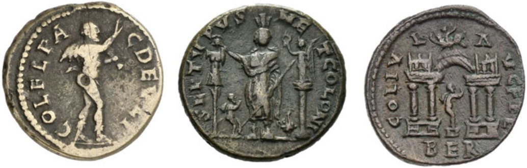
Fig. 6. Note: images not to scale. From left: Reverse of bronze coin of Gordian III, Deultum, 241–42 CE. 7.32 g/23 mm/7h. Münzkabinett der Staatlichen Museen zu Berlin, 18248913. Reverse of bronze coin of Caracalla, Tyre, 209–17 CE. 13.67 g/26 mm/6h. Münzkabinett der Staatlichen Museen zu Berlin, 18257514. Reverse of bronze coin of Elagablaus, Berytus, 218–22 CE. 19.15 g/29 mm/1h. Münzkabinett der Staatlichen Museen zu Berlin, 18202840.

numismatic evidence, between the Forum Marsyas and municipal or colonial status does not hold for the provenienced lamps, none of which are found at such sites. 56 We will return momentarily to the implications this has for interpreting the satyr as an object of political art.