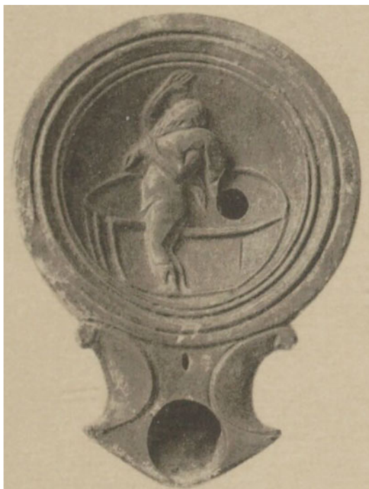
Fig. 2. Terracotta oil lamp of unknown origin, 1st c. CE. 76 mm across. Formerly in the Jules Sambon Collection. (Image after Sambon 1911.)

unknown is whether the lamp was manufactured in Cyprus or imported; while most ex-Cesnola lamps are presumed to be locally made Cypriot products, making such an assessment in the absence of a maker's mark or compositional analysis is problematic. 11