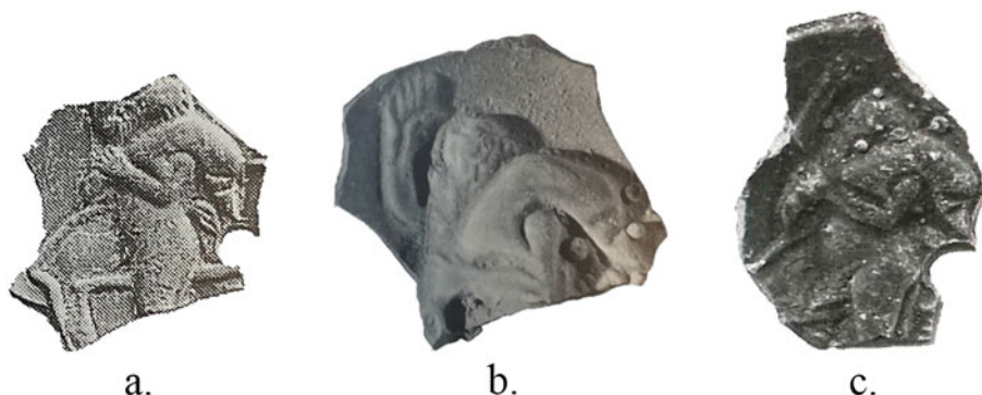
Fig. 3. Terracotta oil lamps (not to scale): (a) Discus fragment, Pergamum, Türkiye, 1st c. CE. Heimerl 2001, pl 18, n. 823; (b) Discus fragment, Magdalensberg, Austria, first quarter of the 1st c. CE. Farka 1977, pl. 62, n. 1294: kärnten.museum , photo: C. Farka; (c) Discus fragment, Vindonissa, Switzerland, 1st c. CE. Leibundgut 1977, pl. 31, n. 104.

on lamps, the subject matter excites little comment. 17 For example, in a pamphlet published in 1885 by the Met as a guide to the collection, the Cesnola lamp is described as simply: “Satyr with a wine-skin on his back.” 18 The follow-up handbook published by John Myres in 1914 includes this lamp in a group of “lamps with Dionysiac Subjects, such as Satyrs, Maenads, and Silenos-masks.” 19 The Magdalensberg and Pergamene lamps are placed in a similar group. The sales catalog for the Sambon lamp alone offered a more specific interpretation, asserting a connection to a statue of the satyr Marsyas from the Forum in Rome. 20 Christa Farka’s publication of the Magdalensberg fragment acknowledged this interpretation briefly, but remained skeptical because of differences between the lamp motif and other depictions of the Roman statue. 21 However, as we shall see, the Sambon catalog’s identification should be preferred to the more general understanding of the motif. Key to this identification are the satyr’s boots, pose, and statuesque treatment, all unusual iconographic elements for a simple satyr.