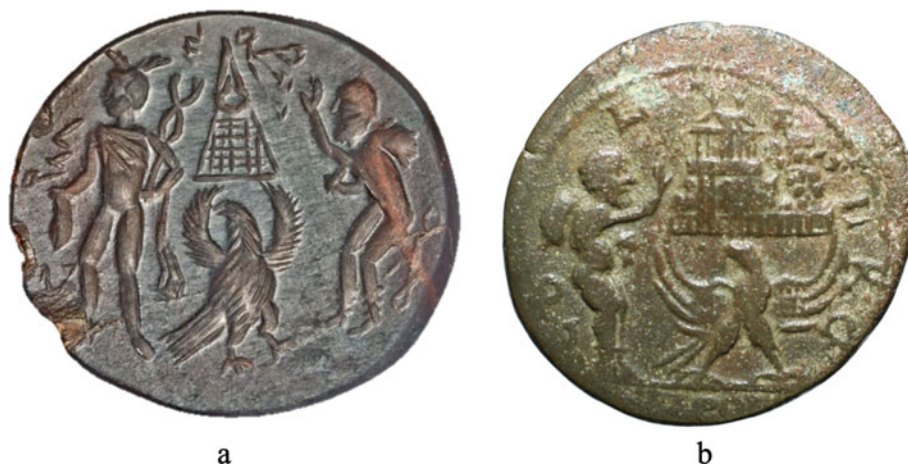
Fig. 8. (a) Hematite amulet, 27.5 x 25 x 3.8 mm, Paris, Cabinet des Médailles N.3500; (b) Reverse of bronze coin of Philip I, Neapolis, 244–49 CE. 14.61 g/28 mm/6h. New York, American Numismatic Society, 1944.100.69135.