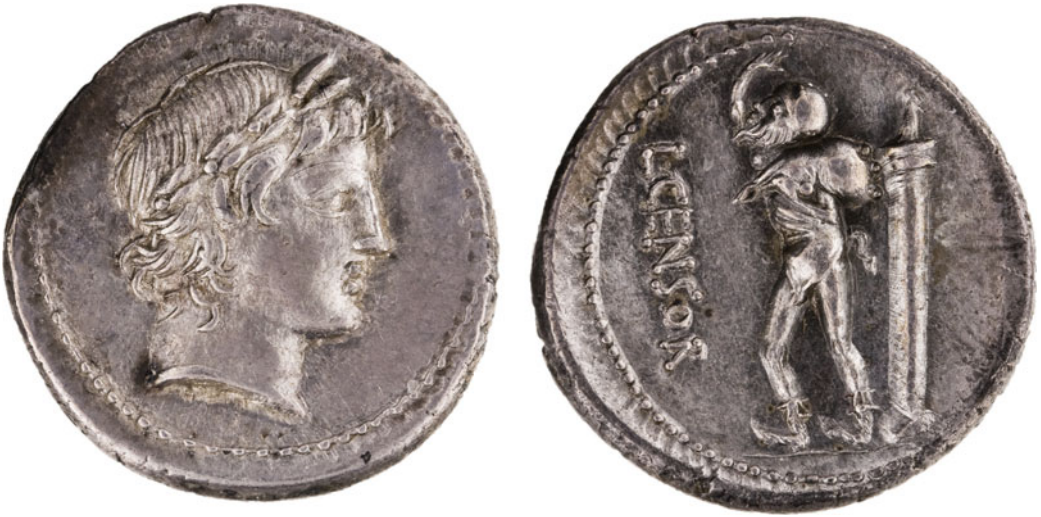
Fig. 4. Silver denarius of L. Marcius Censorinus, Rome, 82 BCE. 3.93 g/4h. Head of Apollo/Marsyas of the Forum and column, L CENSOR.