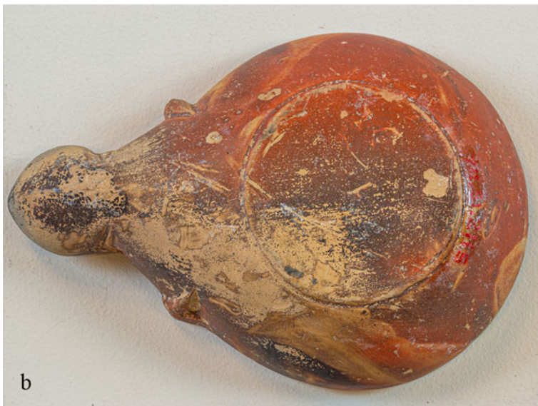
Fig. 1. Terracotta oil lamp, Cyprus, ca. 40–100 CE. 2.7 x 10.6 cm. Metropolitan Museum of Art, New York, Cesnola Collection, purchased by subscription, 1874–76, inv. no. 74.51.2115.

wear and use, is also suggestive of recovery from a funerary context. 10 We cannot know the size or precise date of such a tomb, nor the other objects placed within it (if any). Also