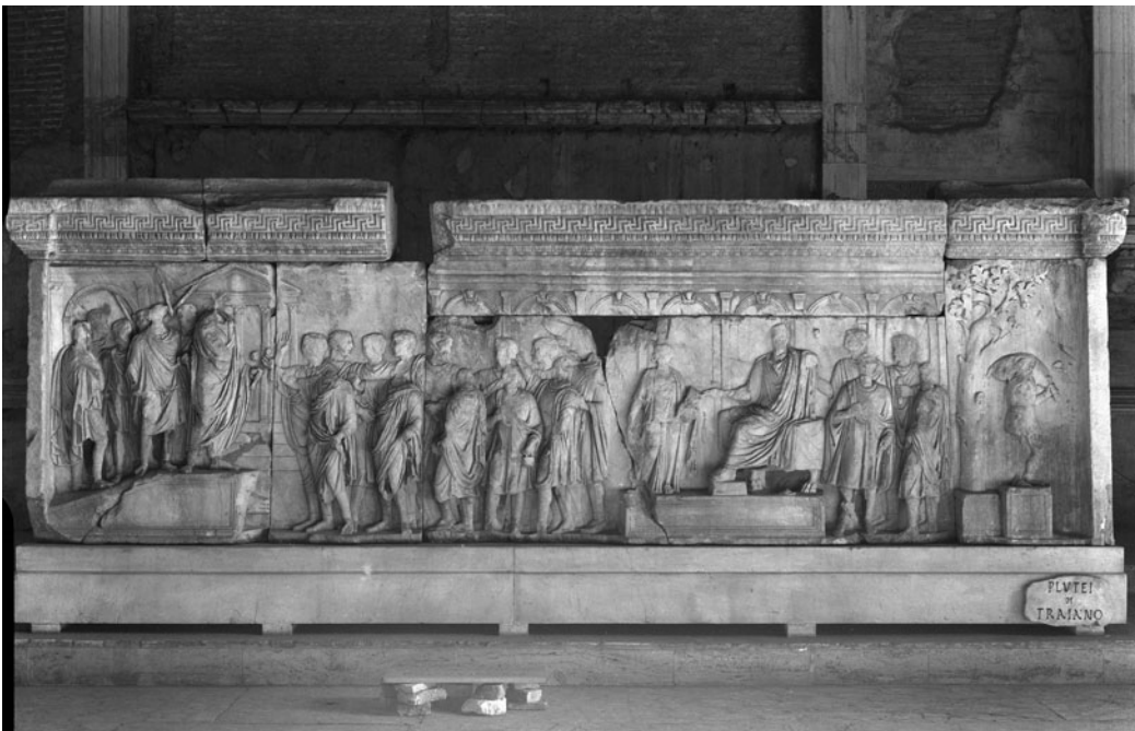
Fig. 5. Anaglypha Fori, alimenta panel, Curia Julia in the Forum Romanum, 2nd c. CE. The Marsyas statue is the first figure on the right. (© DAI Rome, D-DAI-ROM-68.2783. Photograph by J. Felbermeyer.)

The enclosure behind the lamp satyrs deserves some comment, especially as it is absent from other depictions of the Forum Marsyas. Latticed fencing of this kind ( cancelli ) was common in both civic and domestic contexts in the Roman world. 34 For example, the