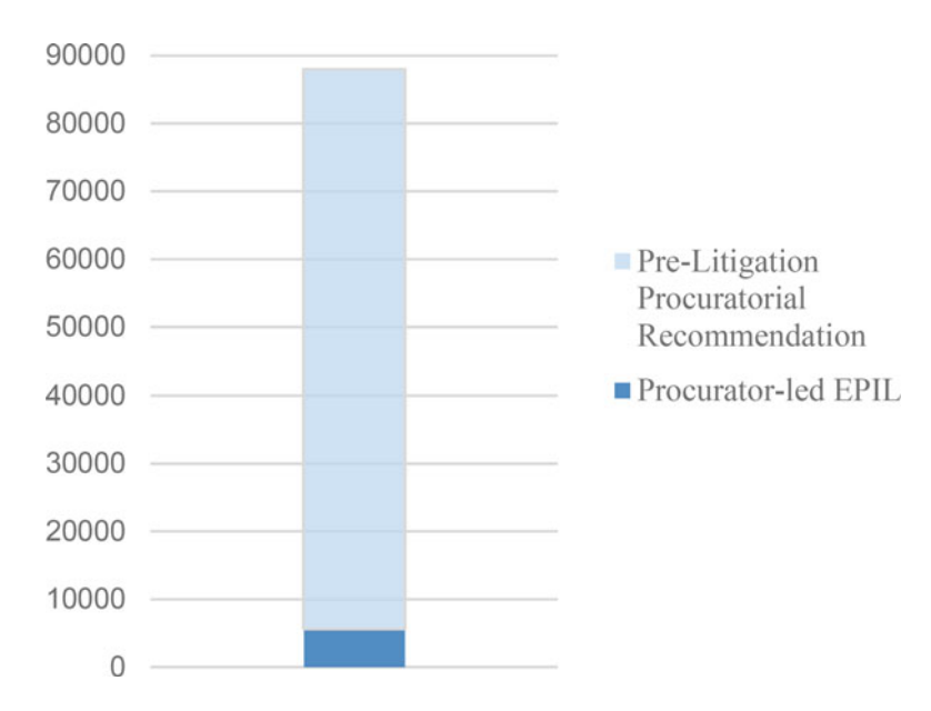
Figure 2 Litigation Actions and Recommendations in Procuratorate EPIL Work (2021)

To summarize, although both NGOs and procuratorates have become active players in the EPIL system, they face distinct legal opportunities. Since 2014, an increasing number of environmental NGOs have brought more lawsuits than ever before. Yet,