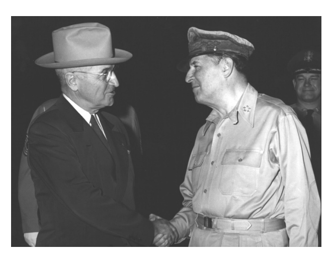
MacArthur and Truman, Wake Island, Oct 15, 1950