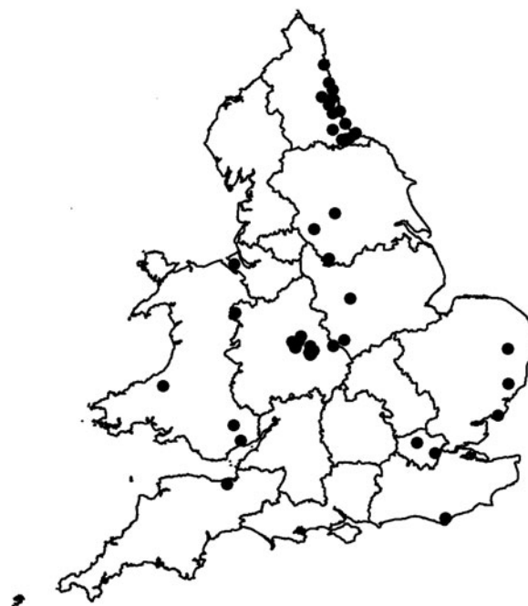
Fig. 1. Distribution of cases across England and Wales, October–November 2013 (postcode data for cases in Scotland was not available).

A total of 77 cases were reported up to 6 December 2013, when the case-control study commenced. The spatial distribution of cases in England and Wales reported prior to the study commencing is shown in Figure 1. Sixty-one cases were eligible for inclusion in the study based on the case definition described above. We received 40 case (response rate 65.6%) and 86 control questionnaires. One case had to be excluded because they had been in close contact with somebody with diarrhoea in the previous 7 days. Four control questionnaires were excluded: two controls had exhibited more than two clinical symptoms in the previous 7 days; one control had been in close contact with somebody with diarrhoea and; one control had travelled outside of Europe. A total of 39 laboratory-confirmed S. Mikawasima cases and 82 controls were therefore included in the analysis.