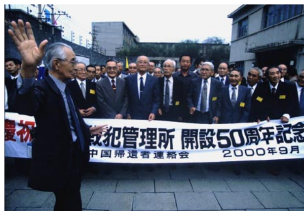
Chukiren celebrates its fiftieth anniversary in September 2000

Unfortunately, as we entered the year 2000, our average age surpassed 80, and many of those who worked tirelessly began to pass away.