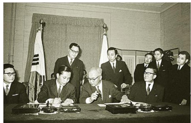
Korean Foreign Minister Lee Tong-won and Japanese Foreign Minister Shiina Etsusaburo sign the Treaty on Basic

Japan and the ROK finally came to agreement in 1965, at the time they signed a treaty of normalization. At this time they also signed the Agreement on Legal Status and Treatment of South Korean Residents in Japan that offered permanent resident status to Koreans who could prove sustained residence in Japan from prior to August 15, 1945, and who had registered as ROK nationals. The agreement had nothing to offer those Koreans affiliated with Choryŏn , whose members essentially became stateless. Mindan Koreans also criticized the agreement. In June 1965, 10,000 of its members assembled in Hibiya Park to demonstrate for terms more equal to Japanese than those they gained by their becoming permanent residents.