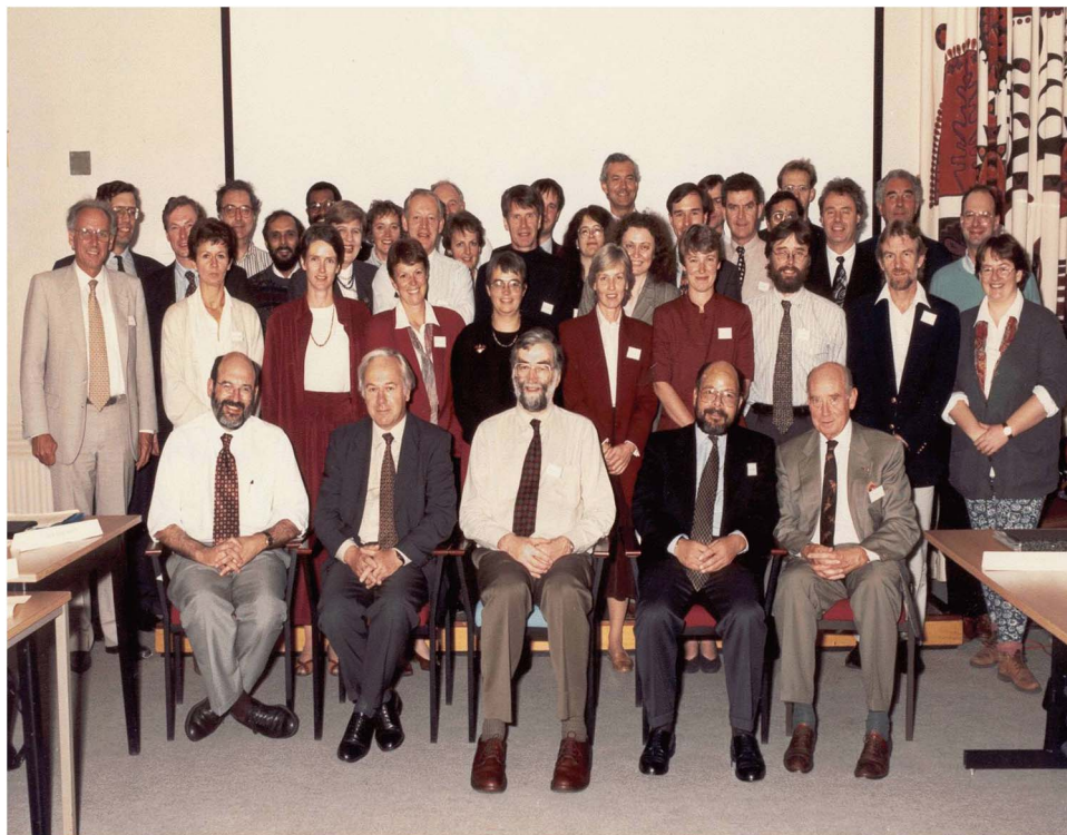
Fig. 2. An early meeting (approximately 1994) of the epidemiologists, clinicians and basic scientists who went on to found the International DOHaD Society.