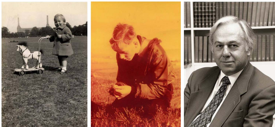
Fig. 1. A lifecourse view of David Barker: as a toddler in London with Battersea Power Station in the background; as a teenager collecting plants as part of a National History Museum project on the Icelandic island of Grimsey; and as Director of the MRC Environmental Epidemiology Unit, University of Southampton.

Fourth, he was a brilliant thinker, had a unique way of looking at data and an amazing memory for data. The only way I can express it is to say that he 'could see data in three if not four dimensions'. His mind could synthesize data coming from different sources and envisage pathways across time in a way that no one