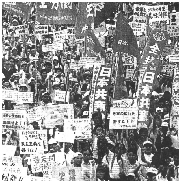
October 22, 1995 protest march and rally

threatened the fabric of Okinawa as a joint US-Japan “base island.” That meeting brought more Okinawans together than ever before or since, and it stirred the two governments to agree between themselves that the bases had to be reduced and Futenma returned. Eleven years on, that promise is nowhere in implementation. The emptiness of the 1996 promise is itself cause for Okinawan distrust.