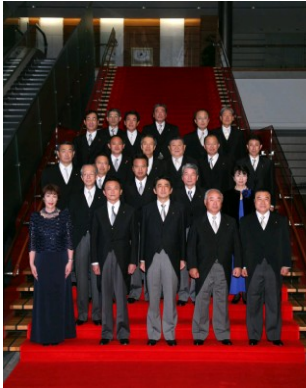
The new Abe cabinet

election, trust in the Abe administration, even on the part of the supposedly conservative local government, was at historically low ebb.