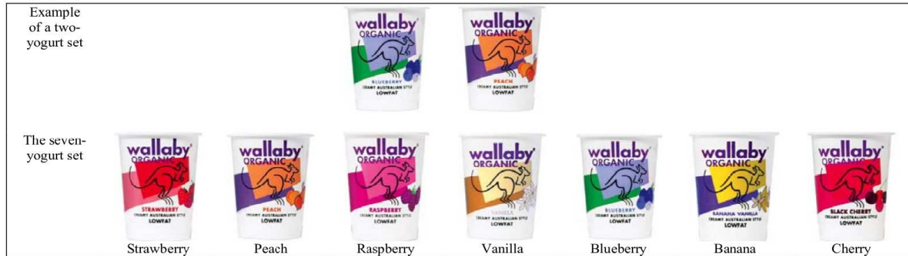
Figure 4: Choice sets used in the follow-up study.

offered 37 children (4.5–5.5 years old) the opportunity to choose a 180-gram yogurt cup to eat, either from a small set (two flavors) or a large set (seven flavors). The possible flavors were banana, blueberry, cherry, peach, raspberry, strawberry, and vanilla (see Figure 4). The procedure was similar to the one used in the crackers task described above. Replicating the snacks results, I again find no effect of assortment size on consumption ( M_{small} = 4.19 , STD_{small} = 1.11 , 95% CI [3.69, 4.69]; M_{large} = 4.07 , STD_{large} = 1.15 , 95% CI [3.54, 4.61]; p > .25 , d = 0.11 , Bayes Factor = 0.332; log consumption in grams is reported and analyzed). 8 Taken together, these results suggest the set size affects engagement as measured in play time, but does not seem to affect consumption as measured by how much the child ate.