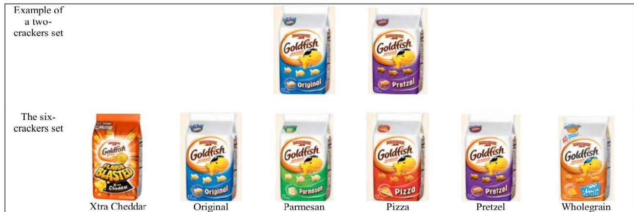
Figure 3: Choice sets used in Study 3.