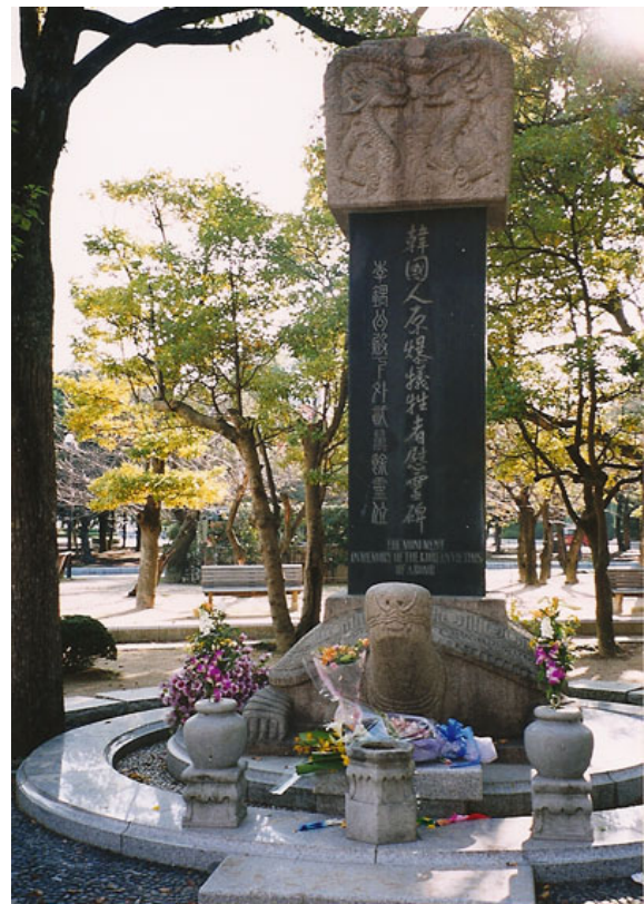
Memorial for the Korean victims of atomic bombing in Hiroshima

in the womb. Hibakusha are not only Japanese → there were also Koreans and Chinese forced laborers (kyosei renko) as well as allied POWs.