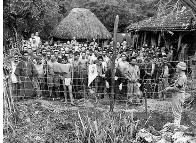
A Marine guards Japanese prisoners of war after the Battle of Okinawa.

The extreme fear of “brute Americans and British” [cultivated by the Japanese military] was a factor that made people choose death. Japanese military experiences of slaughter of Chinese people on the continent since the “Manchurian Incident” was widely discussed; and about the fate of residents at large at the time when the war turned out to be a “losing battle”, people despaired anticipating plunder, violence, slaughter by the American military. There were returned migrants who thought “the American military can no way be expected to kill residents”, but returnees were regarded as suspected spies and hence were unable to speak positively. To make such a statement was to court denunciation as a spy and slaughtered.