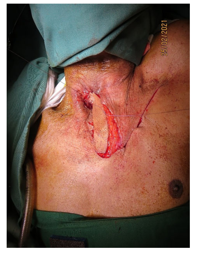
Figure 4. Intervening neck skin incised in view of prior radiation causing severe dermal atrophy.