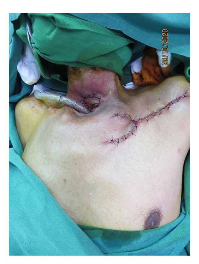
Figure 5. Complete flap inset with primarily closed donor site.