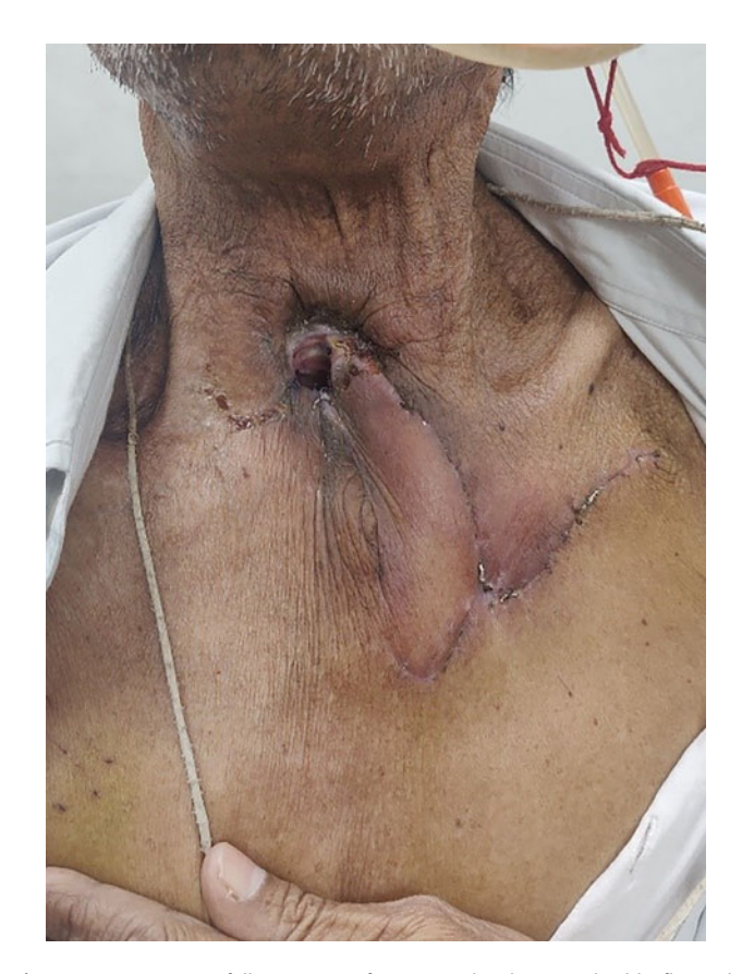
Figure 6. Post-operative follow-up view after two weeks, showing a healthy flap with no donor complications.