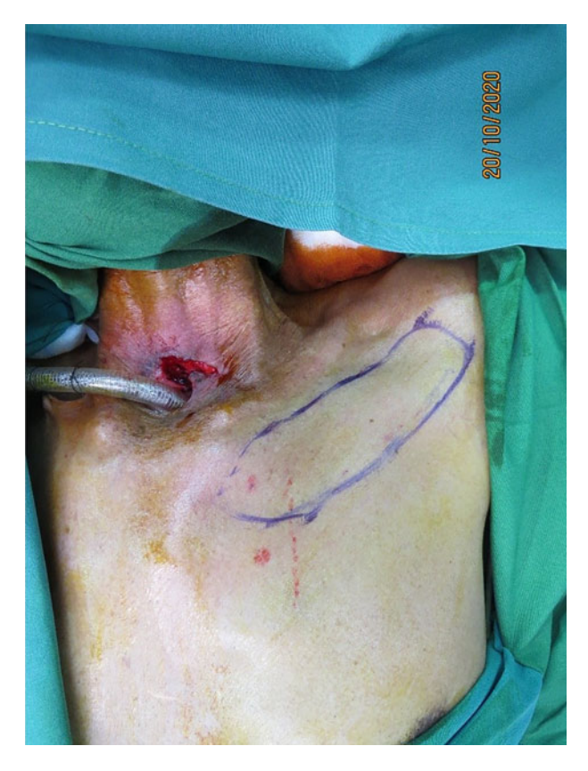
Figure 1. Left second internal mammary artery perforator flap marked below the clavicle.