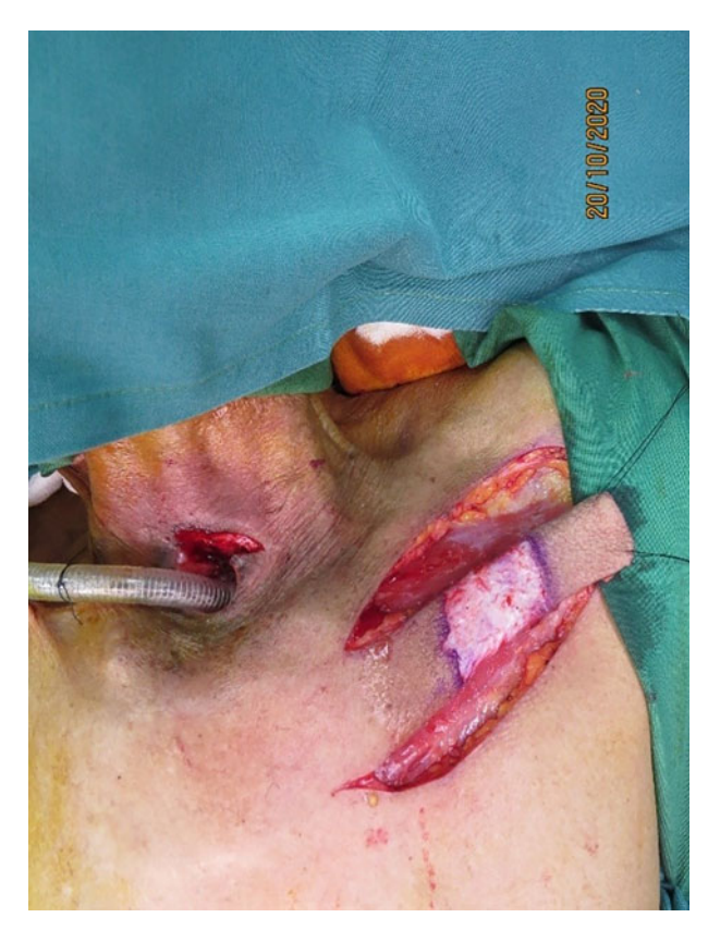
Figure 3. Flap elevation with de-epithelised intervening segment.