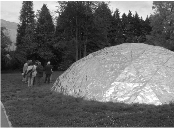
Fig. 4. “Le sentier planétaire” (the planetary path) on the UJF campus: starting with the Sun.