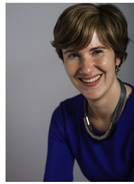
ANXIETY working group.

anxiety disorder: a neurocognitive approach. General background and key question of project. 2014 osf.io/e368 h.