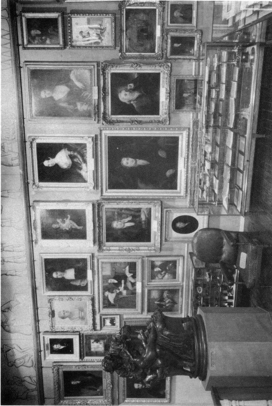
Plate 2. The Jenner section of the Wellcome Historical Medical Museum, c. 1920s.