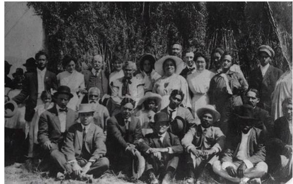
Iosepans photographed on Hawaiian Pioneer Day, circa 1914. This annual celebration, held on August 27 th , commemorated the Hawaiians' arrival to Iosepa with feasts, music and dancing. The events were attended by former missionaries, prominent church leaders and neighbors.

By the late 1880s, Salt Lake City had embarked on its rocky career as the eastern hub of Oceania. The Mormons had first landed in Hawai'i in the 1850s and, having failed among Euro-Americans, turned their attention to Native Hawaiians, learning their language, converting leaders and establishing plantation settlements enabled by new laws allowing foreign land ownership. For Natives, the faith aided the preservation of communal beliefs and practices in the context of rapid, dislocating change, including those brought by Mormon newcomers themselves. In the absence of a temple in the Pacific, Native converts began migrating to Utah, settling in the Warm Springs area of North Salt Lake City. The movement enacted the Mormon concept of "gathering," but was also continuous with historically deep Hawaiian journeys of discovery, trade and labor that spanned the Pacific, including the Western edges of the imperial United States. Inscribed in Mormon imaginaries as Lamanites—descendants of Abraham who had traveled to the Americas and, after great wars, into the "west sea" in an "exceedingly large ship"—and gathered into a racially-stratified American West, the Hawaiian arrivals were socially and economically subordinated.