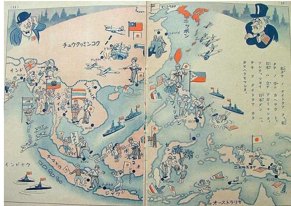
This 1943 map of the “Great East Asian Co-Prosperity Sphere” from a World War II Japanese propaganda booklet shows the defeated Euro-American colonial powers in chaos and warm relations between Japan and conquered peoples. It may have targeted colonial subjects in Japan’s wartime empire.

Three particular moves and sensibilities make this work possible. First is a critical awareness of the inherited geographic frames of dominant scholarship, and a curiosity about not only their obvious holds on historical practice, but their more subtle ones. Second is the courage to rebel against the not-so-soft power of job descriptions, graduate seminars, journal titles, and professional associations as they impart spatial and geographic categories—including oceanic ones—within which the historical imagination is supposed to legitimately and exclusively pool. Third, and enabled by the first two, are inquiries into how historical actors themselves conceived of, practiced and struggled over their own position and mobility. What were their compass points? How did they define “home” and “away”? What power did they have to direct their movements, and what