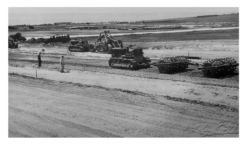
Figure 2. Soil compaction of the reinforced concrete runway at Yeşilköy Airport, c.1950. Sarıgöl, op. cit., p. 104 (used with permission).

concrete aggregates. The use of beach sand is undesirable but sand is not available from other sources ... it may be necessary to blend other material with the beach sand to obtain the proper gradation' (Figure 2).<sup>39</sup>