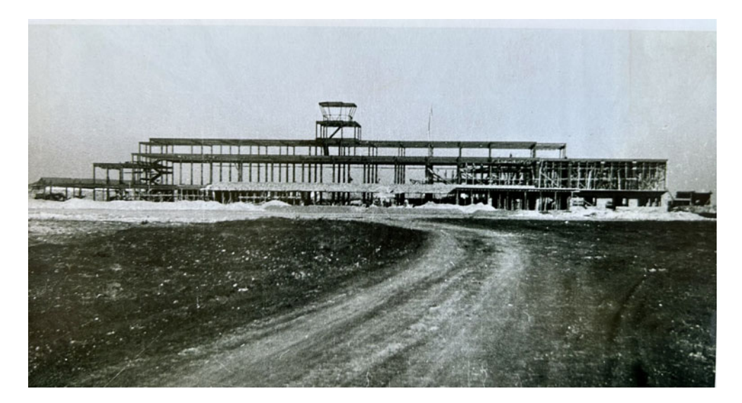
Figure 1. Construction of the main terminal at Yeşilköy Airport, c.1950. Gökhan Sarıgöl, A Centenary Journey, Istanbul: TAV Press, 2019, p. 105 (used with permission).