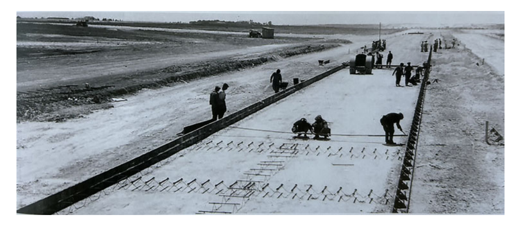
Figure 3. The construction of the reinforced concrete runway at Yeşilköy Airport, with its transverse and longitudinal steel supports, general view, c.1950. Sarıgöl, op. cit., p. 103 (used with permission).