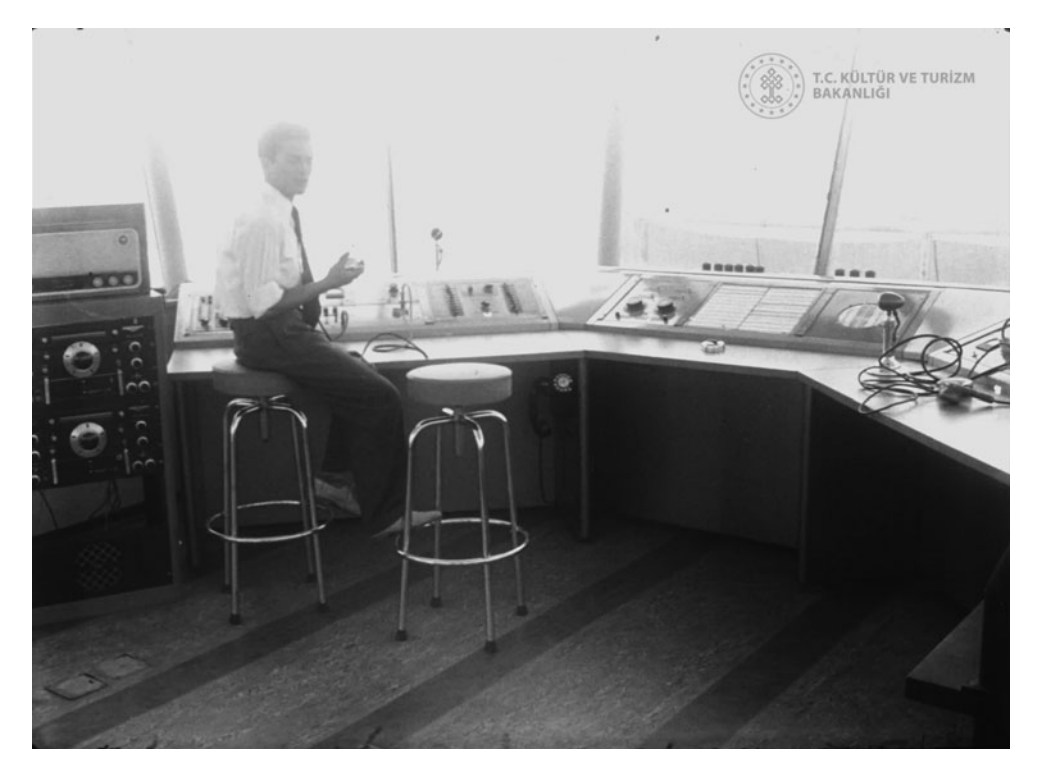
Figure 5. The interior of the air traffic control tower at Yeşilköy Airport, grand opening ceremony, 1953.

of underground cables, a backup power station with 225 kilowatts of power, a two-hundred-line telephone exchange and twelve radio transmitter and receiver posts. Furthermore, the airport was equipped with blind flight equipment, advanced ground control approach devices to ensure flight safety especially during night flights, a US military-grade SCS 51 instrument landing system (ILS) to prevent accidents during blind flights, and a very-high-frequency (VHF) omni-directional radio range (VOR) system to assist planes in keeping on course, regardless of wind velocity, thereby preventing airborne collisions (Figures 5, 6).<sup>64</sup>