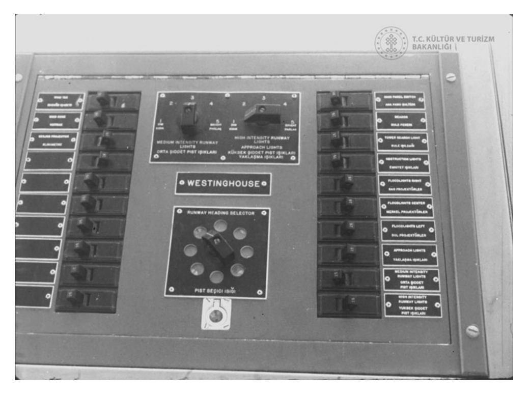
Figure 6. A close-up view of the Westinghouse equipment in the air traffic control tower at Yeşilköy Airport, 1953.

in 1952 as a result of its participation in the Korean War, and its increasing significance on the front line between the communist East and the democratic West. The minister of transportation, Yümnü Üresin, alluded to this reality when, during his speech at Yeşilköy's opening ceremony, he stressed that the airport is located in the Black Sea strait, one of the most strategic points in the world, between the Black Sea and the Mediterranean. Moreover, he added that because of this, airports and airlines would play a larger civilian and military role in the region in the years to come.<sup>65</sup>