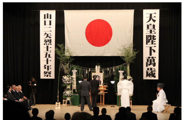
Figure 23: Fifty years after his act, Yamaguchi Otoya supporters held a memorial ceremony on the stage of Hibiya Public Hall where he killed Asanuma.

Fifty years to the day of Asanuma's assassination—on October 12, 2010—the Otoya Yamaguchi Appreciation Society held a ceremony to commemorate Yamaguchi's "heroic" act.