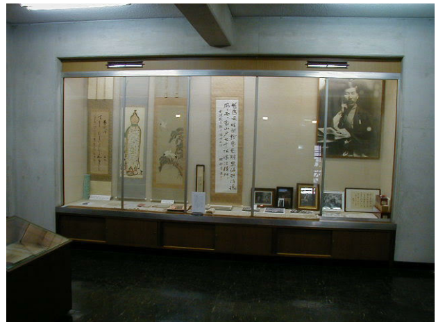
Figure 13: Kotoku memorabilia on display at the public library in his home town of Nakamura City, Kochi Prefecture.

Kotoku's execution was to have repercussions 13 years afterward, when on 27 December, 1923, Namba Daisuke, son of a Diet member from Yamaguchi, fired shots at the carriage carrying Crown Prince and Regent Hirohito at