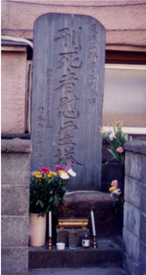
Figure 11: Monument erected by the Japan Bar Association at the site of the gallows at the former Ichigaya Prison, where Kotoku Denjiro and 11 other anarchists were hanged for plotting to assassinate the Meiji Emperor.