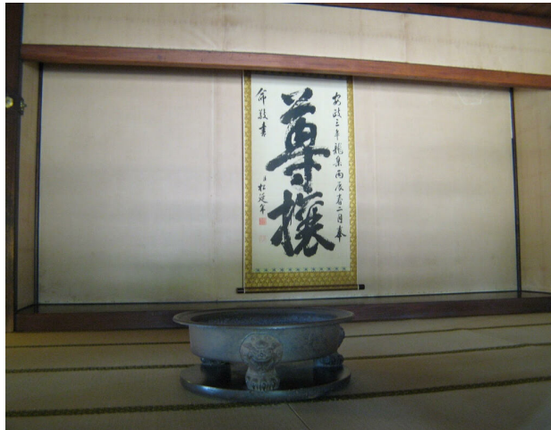
Figure 8: "Sonjo" scroll hanging at the Kodokan academy in Mito, where young samurai were imbued with the slogan "Sonno Joi" (revere the Emperor and expel the barbarians).

Japan's restoration to imperial rule from January 3, 1868 would eventually leave a large class of disenfranchised samurai, resentful over the loss of their power and class privileges. On May 14, 1878, the carriage of Lord of Home Affairs Okubo Toshimichi was attacked by a group of ex-samurai from the Kaga domain (Ishikawa Prefecture). The 47-year-old Okubo, a native of Satsuma (Kagoshima) and remembered as one of the three great nobles who led the Meiji Restoration, was literally cut to ribbons and died on the spot. The monument to Okubo and an explanatory bilingual signboard are situated in Shimizudani Park in Kiyoi-cho, directly across the street from the Hotel New Otani.