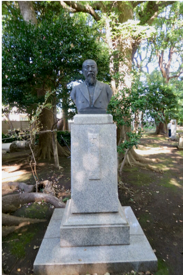
Figure 1: Bust of Ito Hirobumi at his grave in Shinagawa, Tokyo.

Abe was fatally shot in Nara on July 8, 2022 by a 41-year-old unemployed former Self-Defense Force member, Tetsuya Yamagami, while the former Prime Minister campaigned on behalf of an ally for the upcoming lower house elections. For his weapon Yamagami had used a homemade gun he produced following instructions on the internet. His stated motive for his crime was anger over Abe's ties to the Unification Church, founded in 1954—coincidentally the year Abe was born—by Korean evangelist Moon Sung Myong (1920–2012). Yamagami explained that his mother's donations to the Japan branch of the church had bankrupted his family.