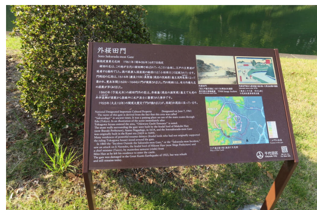
Figure 2: Bilingual signboard at Sakuradamon gate.

On March 24, 1860 Tairo (great elder) Ii Naosuke, the most powerful official in the Tokugawa bakufu, was approaching the Sakuradamon gate of Edo castle when his retinue was attacked by a troupe of 17 shishi ("men of high purpose") from the Mito domain (and one from Satsuma). A heavy snow was falling, and the oilskin protective clothing worn by Ii's guards made it difficult for them to draw their swords quickly. During the bloody melee, Ii, age 44, was dragged out of his palanquin and decapitated.