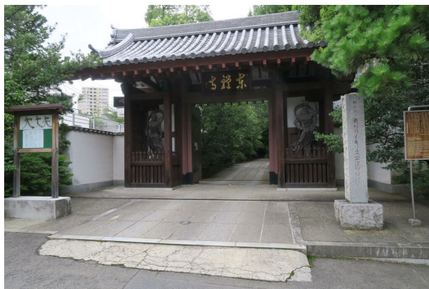
Figure 6: Gate of the Tozenji temple, site of Great Britain's first legation in Edo where Kobayashi Denkichi was assassinated.

On January 29, 1860, Kobayashi Denkichi, interpreter to the British legation, was fatally wounded by two samurai outside the gate of the Tozenji temple in Takanawa, just off the Tokaido road linking Edo to Kyoto. The Wakayama native's fishing boat had gone adrift when he was rescued by an American vessel and taken to San Francisco, where he learned English. He later traveled to Hong Kong, acquired British nationality and accompanied Great Britain's first ambassador, Sir John Rutherford Alcock, to Japan in 1858.