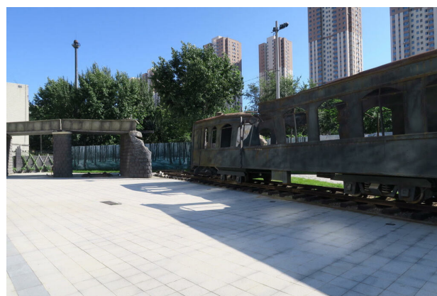
Figure 15: Actual size reproduction of the train in which Zhang Zuolin was assassinated by members of Japan's Kwantung Army at Huanggutun, Shenyang (formerly Mukden) in June 1928.

In the early morning hours of June 4, 1928, members of the Japanese Kwantung Army attached a powerful bomb to the underside of a railway trestle at Huanggutun, an intersection of two rail lines just outside of the old Manchu capital of Mukden (present-day Shenyang). As the train carrying Manchurian warlord Zhang Zuolin passed underneath, the device was set off, killing Zhang as he sat in his private rail car playing mahjong.