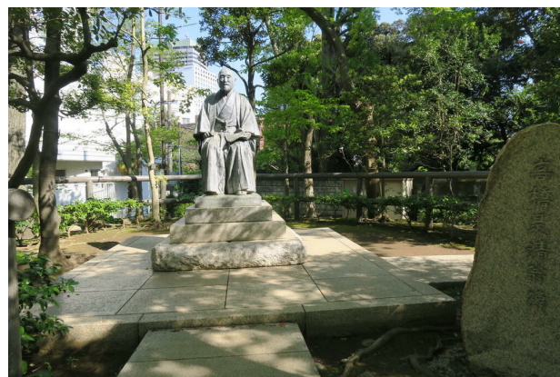
Figure 18: Statue of Takahashi Korekiyo at the site of his former residence in Aoyama.

The four important figures assassinated that day included 81-year-old Minister of Finance Takahashi Korekiyo who had previously served as president of the Bank of Japan and prime minister. At gunpoint, a servant led two officers into his bedroom, where they killed Takahashi as he slept.