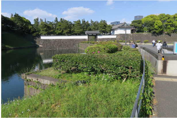
Figure 3: The Sakuradamon gate as it appears today.

Two years earlier, Ii had ordered the Ansei Purge, jailing, exiling and in some cases executing 100 individuals suspected of disloyalty to the Tokugawa government. The killers also objected to Ii's having negotiated, and in July 1858 signed, the Treaty of Amity and Commerce between Japan and the United States, as well as subsequent treaties with European powers.