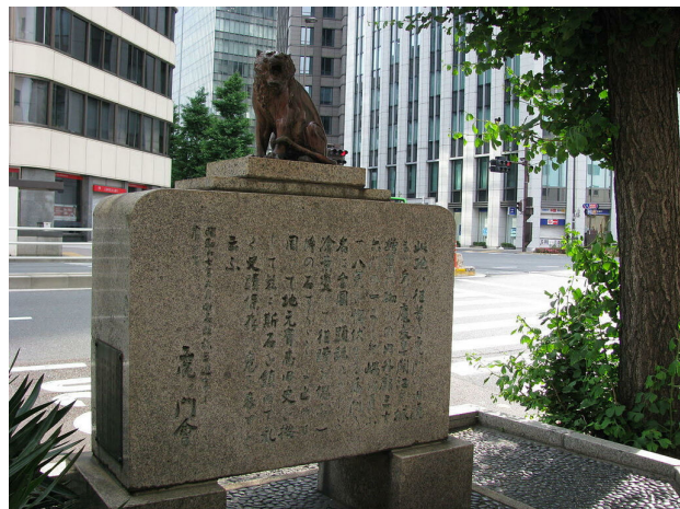
Figure 14: Memorial near Toranomom subway station where Crown Prince and Regent Hirohito was targeted by an assassin in December 1923.

the Toranomom intersection while en route to a Diet session. Hirohito was unharmed.