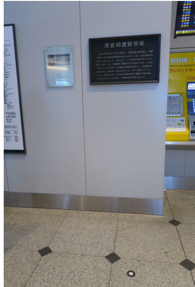
Figure 16: Small white hexagon on the floor of Tokyo Station (Marunouchi South Exit) indicates where PM Takashi Hara was standing at the moment he was slain. Explanation is posted on the wall behind it.

During the first three decades of the 20th century, the prime minister of Japan became a high-risk occupation. A plaque under the rotunda of the Marunouchi South Exit indicates where Prime Minister Hara Takashi (65) was stabbed to death by a railway worker on November 4, 1921. A second, mounted on a pillar close to the wicket of the Tokaido Shinkansen, indicates the spot where, on November 14, 1930, Prime Minister Hamaguchi Osachi was shot by a member of an ultranationalist secret society.