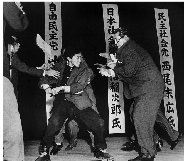
Figure 21: Prizewinning photo shows the already mortally wounded Asanuma attempting to ward off his assailant's second attack.

The following year, Mainichi Shimbun photographer Nakao became the first Japanese to be awarded Pulitzer Prize for his photograph, which captured the physically imposing Asanuma—already mortally wounded—extending his hands in a futile attempt to ward off the diminutive Yamaguchi's second thrust.