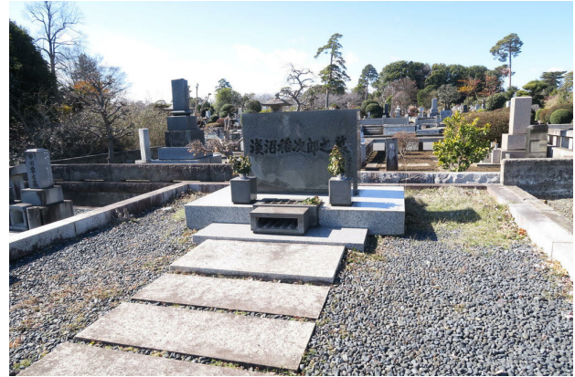
Figure 22: Asanuma's grave in Tama Cemetery, west Tokyo.

Fifty years to the day of Asanuma's assassination—on October 12, 2010—the Otoya Yamaguchi Appreciation Society held a ceremony to commemorate Yamaguchi's "heroic" act.