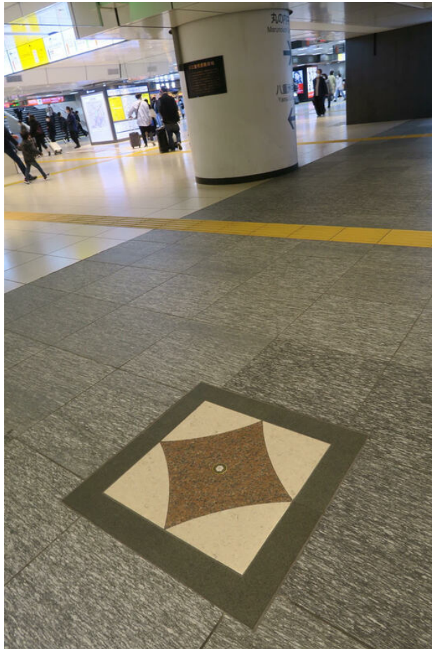
Figure 17: Square in Tokyo Station indicates where PM Isachi Hamaguchi was standing when attacked in 1930. The details are explained on the pillar in the background.

Hamaguchi had infuriated opponents of the London Naval Treaty, which he had supported as an austerity measure to deal with Japan's economic crisis. He lingered for nine more months but never recovered from his wounds, passing away at age 61.