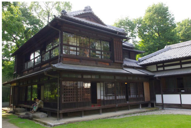
Figure 20: Takahashi Korekiyo's former house was moved to an outdoor museum in Koganei. He was killed while sleeping in an upstairs bedroom.

Takahashi's former residence became a memorial park next to the Canadian Embassy in Aoyama. The house in which he was slain still stands, and can be visited at the Edo-Tokyo Open Air Architectural Museum in Koganei City.