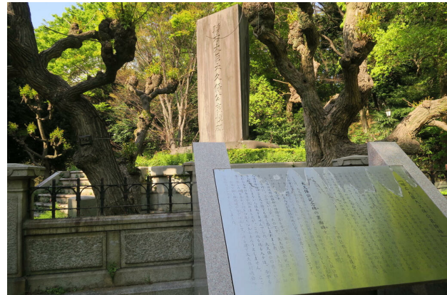
Figure 9: Monument at the site of Okubo Toshimichi's assassination in May 1878.

Japan's restoration to imperial rule from January 3, 1868 would eventually leave a large class of disenfranchised samurai, resentful over the loss of their power and class privileges. On May 14, 1878, the carriage of Lord of Home Affairs Okubo Toshimichi was attacked by a group of ex-samurai from the Kaga domain (Ishikawa Prefecture). The 47-year-old Okubo, a native of Satsuma (Kagoshima) and remembered as one of the three great nobles who led the Meiji Restoration, was literally cut to ribbons and died on the spot. The monument to Okubo and an explanatory bilingual signboard are situated in Shimizudani Park in Kiyoi-cho, directly across the street from the Hotel New Otani.