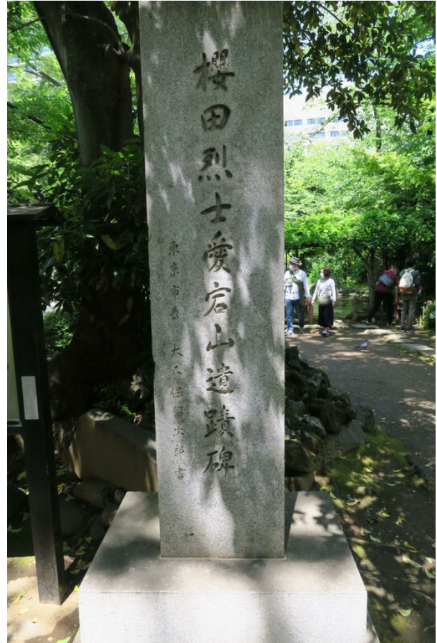
Figure 4: Monument to Ii's assassins, who converged at the Atago Shrine before embarking on their bloody quest.

Romulus Hillsborough's 2017 work, Samurai Assassins: "Dark Murder" and the Meiji Restoration, 1853-1868 explains the background, circumstances and description of the Sakuradamon Incident. The book also details the unsuccessful attempt on the life of Ando Nobumasa, Ii's successor, in a similar attack outside the Sakashita gate of the castle on February 13, 1862.