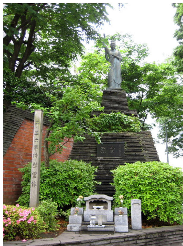
Figure 19: Statue of the goddess Kannon erected on the spot in Shibuya where the Feb. 26 assassins and their leaders were executed.