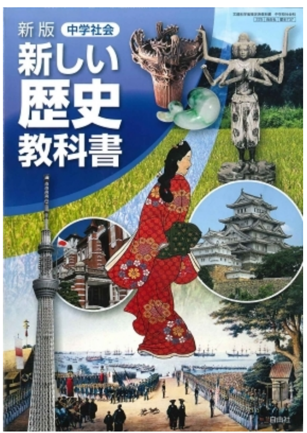
History and Civics textbooks published by the Japan Society for History Textbook Reform

Following this shift to the right in the representations of Japanese history was the simplification of the issues associated with war memory. There have always existed debates about Japan's role in the Asia-Pacific War. But by the 21<sup>st</sup> century, the points of contention in these controversies had shifted dramatically from the specific to the symbolic. For example, in the case of the "comfort women" issue, the original debate focused on the number of women involved, what kind of treatment they received, and, most importantly, whether or not the Japanese wartime government was involved in the setting up of the "comfort" stations and recruiting the women. The most heated debate that ensued in the recent years revolves not around but issues, rather, individuals-Japanese nationals who argue that there existed a Japanese state-controlled