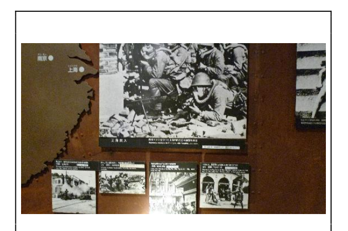
Displays that were eliminated with the "renewal"

This essay will analyze this recent trend in Japanese war memory through three avenues: 1) the 1995 paradigm: the conservative turn in the mid-1990s as a reaction to the series of official apologies that were issued by the Japanese government for the fiftieth anniversary of the end of the war; 2) "postmemory": the shift in war memory in recent decades influenced by the rapid decrease in the number of war survivors; and 3) memory activists: an examination of whose memories-and what kind of memories-are actively being remembered today. Through these three themes, the essay explicates the unresolved nature of Japan's relationship with its wartime past. In particular, the victimhood consciousness held by a large majority of Japanese, as well as the failure by relatively liberal administrations to systematically resolve the issues through research, outreach, and education, have hampered Japan's efforts for reconciling with its history.