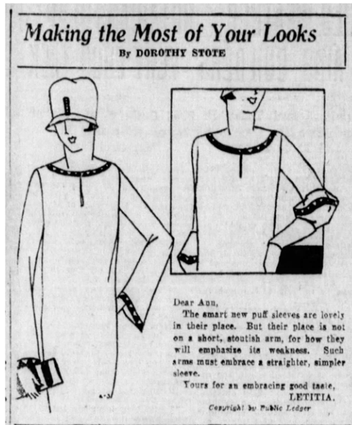
Figure 8. Dorothy Stote's "Making the Most of Your Looks" always pictured slim white women and spoke about their figures as needing to be fixed. Here the article refers to "a short, stoutish arm." Mansfield News (Ohio), Feb. 8, 1927, 11; the feature was syndicated by the Philadelphia Public Ledger .

responses with silverware. The Call sometimes aired readers' pointed or even radical critiques of the status quo, from a woman who recounted going on strike from housework to one who advocated adopting men's dress. Yet the Call belittled these responses when it printed above them "Awarded a silver cheese scoop," or "Awarded a silver jelly spoon," and it seemed to send the winners right back to domestic duties with their prizes. 121 In a 1927 article titled "What Shall We Do With the Woman's Page?" Crystal Eastman called for a more open, collaborative space in the newspaper. "Modern women need a forum, a clearing-house for the exchange of ideas, a meeting-place where they can learn of each other's experiments and benefit by each others conclusions," she wrote. 122 Eastman had no memory of the turn-of-the-century women's columns that had sometimes served these purposes.