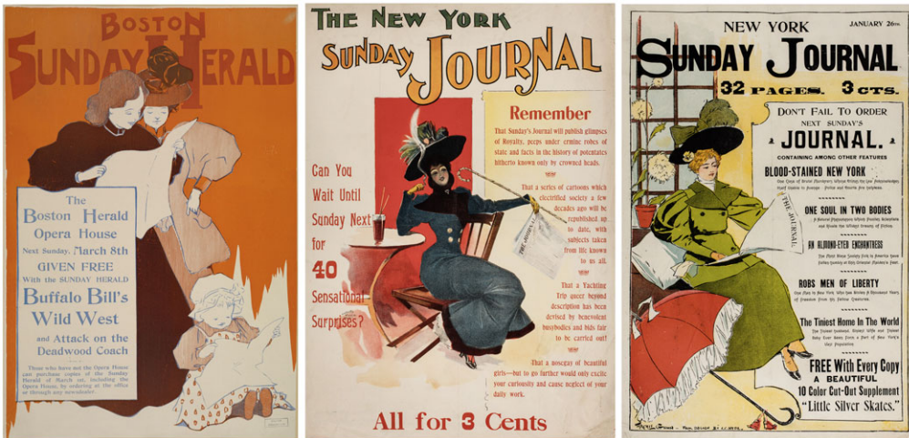
Figure 1. Boston Sunday Herald poster, 1893–1897, New York Public Library Art and Architecture Collection. New York Public Library Digital Collections, https://digitalcollections.nypl.org/items/510d47e2-8f2b-a3d9-e040-e00a18064a99 (accessed Nov. 16, 2024). New York Sunday Journal poster, undated. Art Poster File, PR 055-001-04517, New-York Historical Society. New York Sunday Journal poster, January 26th [18–]. Art Poster File, PR 055-001-0492, New-York Historical Society.