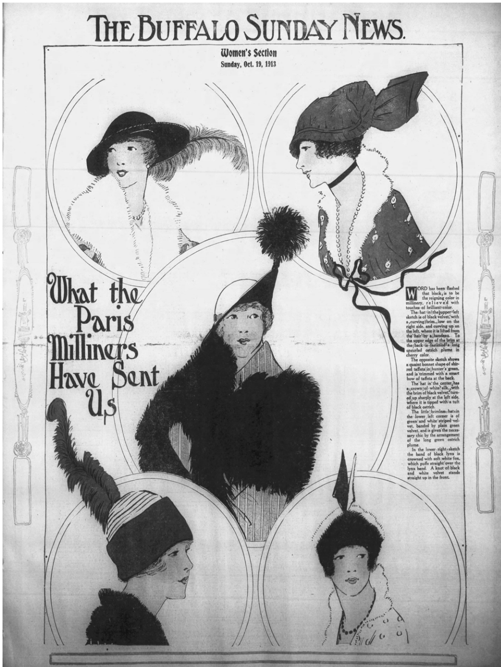
Figure 5. Full page from Buffalo Sunday Morning News , Oct. 19, 1913, first page of women's section.

of packed auditoriums for its free "Cookery and Homemaking Schools," with audiences ranging from 3,000 to 10,000. 91