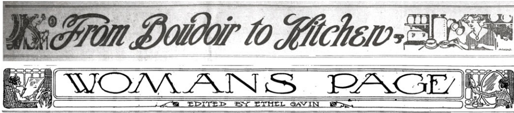
Figure 6. Illustrated headings for the women's page, seemingly indicating women's domain. Referring to and picturing women only within the home might have communicated luxury or constraint, depending on the reader. Buffalo Sunday Morning News , Mar. 23, 1913, 28; Chicago Defender , Apr. 23, 1921, 5.

Some readers asked for and appreciated the optimism, fantasy, and escape of the women's page. Answering the New York Herald's 1891 survey of what women wanted in their newspapers, one reader responded "write us long columns of happiness." 112 A 1901 reader praised the Atlanta Constitution's women's page for casting "sunbeams across the home keeper's dusty, every day road." 113 In a 1904 etching, the artist John Sloan depicted the escapist pleasure to be had from the women's page (Figure 7). A woman in a tenement momentarily ignores or forgets her surroundings—the unfinished washing in the basin, the cat that is clawing the comforter. Instead she peruses the newspaper's "Page for Women."