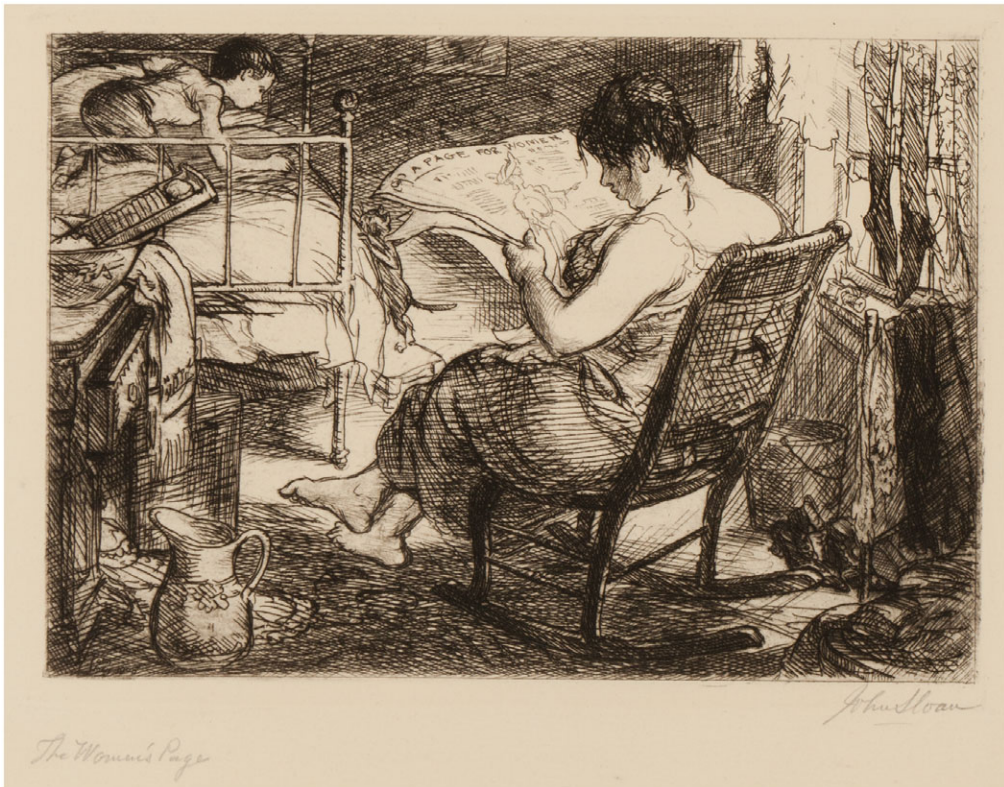
Figure 7. John Sloan (American painter, etcher, and illustrator, 1871–1951), The Women's Page , 1905. Etching. Plate: 4 13/16 × 6 3/4 in. Sheet: 9 1/4 × 12 5/8 in. Gift of Helen Farr Sloan, 1963.

offered genuine service and counsel, and could feed very real needs. 119 Yet by transitioning away from open letter columns and toward themed advice columns, newspapers eliminated the space in which women readers advised each other. They stopped reminding subscribers of the knowledge, generosity, and goodwill of the other women who were also reading and writing to the newspaper and instead trained them to look to experts for advice.