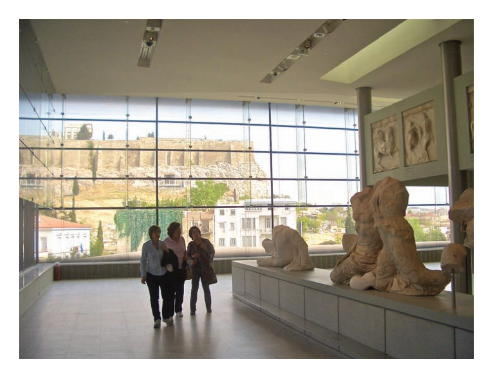
Figure 4. Parthenon Gallery, the Acropolis Museum, Athens, Photograph: author.

regain an ahistorical "wholeness" and integration of their collections and cultures that is belied by the complex translation and fragmentation of objects and cultures across time and place. Conversely, one of the chief problems underlying the British Museum's position is the extent to which it fails to acknowledge the difficulties inherent in any institutional claim to be able to speak on behalf of "world citizens" everywhere, while simultaneously denying them the agency to answer back on their own terms.