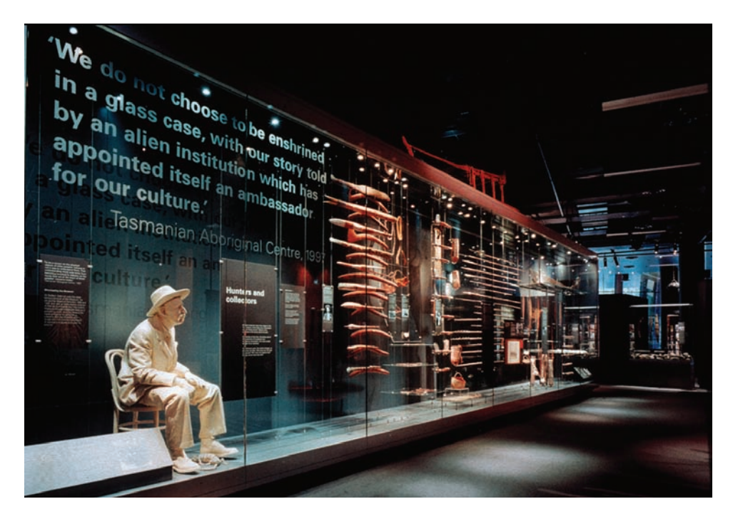
Figure 1. Spencer Cabinet, Two Laws exhibition, Bunjilaka permanent exhibition, Melbourne Museum, Melbourne, Photograph courtesy of Design Craft Furniture Pry Ltd.

the D'Entrecasteaux Channel, as she had always wanted, nearly 100 years after her death (Smith 1980).<sup>1</sup> This historic moment of restitution coincided with the initial steps taken by Indigenous communities in a long and painful process aimed at identifying human remains in museums around the world and then requesting their return to their source communities, an ongoing process that involves scores of museums, including the British Museum, whose reticence in countenancing claims for human remains has been noteworthy.<sup>2</sup>