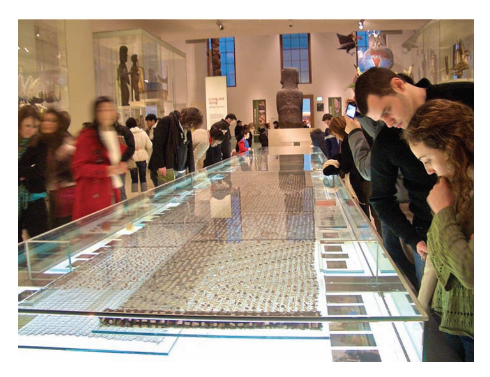
Figure 2. Cradle to Grave display, Living and Dying permanent exhibition, the British Museum, London, Photograph: author.

works in the context of a more holistic and less exclusionary definition of world cultures is the Living and Dying exhibition at the Wellcome Trust Gallery that opened in 2003. This gallery adopts an innovative cross-cultural examination of how different world cultures deal with the universal preoccupations of illness, danger, death and dying. The works on display range from Sri Lanka to the Solomon Islands, but so as not to entirely exoticize the "other" of non-Western cultures, an evident care has also been taken to include a comparative emphasis on Western cultural attitudes.