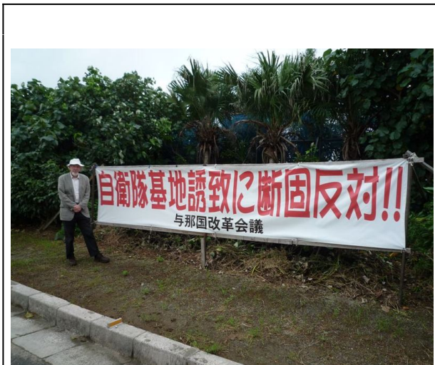
Anti-base poster, Yonaguni, November 2011

East Asia’s territorial issues, notably centred now on the Senkaku/Diaoyu Islands, will either be solved, as part of a comprehensive settlement and the construction of a regional order of peace and cooperation in the interests of the surrounding states and peoples, or they will fester and feed heightened confrontation and militarization. It is hard to see evidence of the former at present. As for the latter, it will mean places like Yonaguni becoming more vulnerable and divided.