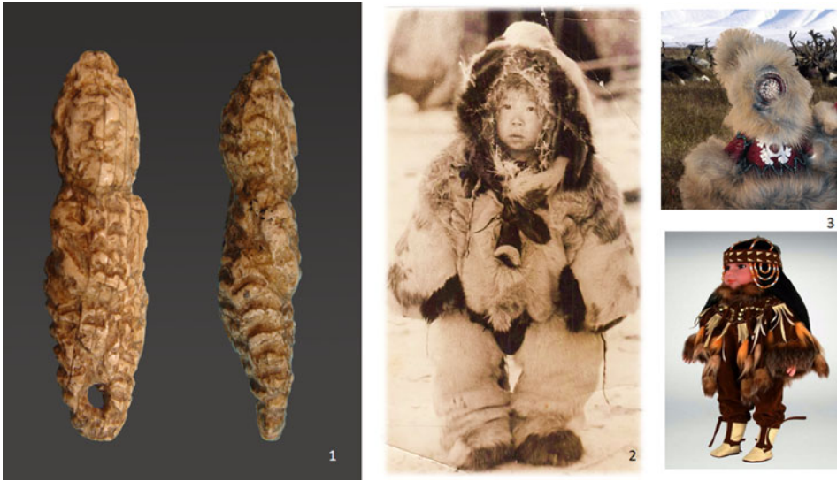
Figure 2. Ivory figurine of a child in fur coverall and ethnographic interpretations. (1) Image of child figurines from the collection of Mal'ta (State Hermitage No370/752); (2) ethnographic photo of the beginning of the twentieth century as an evidence for similar types of clothing; and (3) images of modern Chukchee doll in recent times.