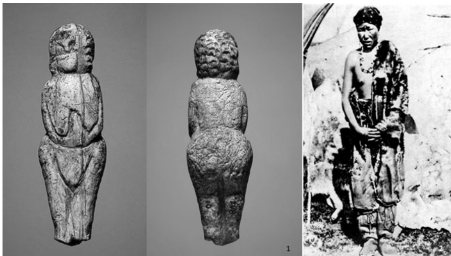
Figure 4. (1) Image of an adult woman from the Mal'ta Collection (Hermitage, No. 370/748); (2) a photograph of northern Indigenous Chukchi woman in summer (Bogoraz, 1904, plate XXVII, fig. 3).

and objects ornamented in part or in full. The figurines which are engraved can be broken into the following groups: