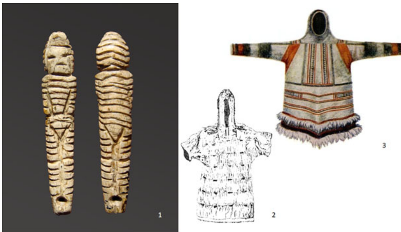
Figure 3. Ivory figurine of a child in coverall and ethnographic interpretations. (1) Images of child figurines from the collection of Mal'ta (State Hermitage No. 370/753); (2) ethnographic evidence for similar types of clothing worn by peoples of this same region in recent times (Bogoraz, 1904, fig. 180); and (3) images of modern Chukchee doll's summer clothes.