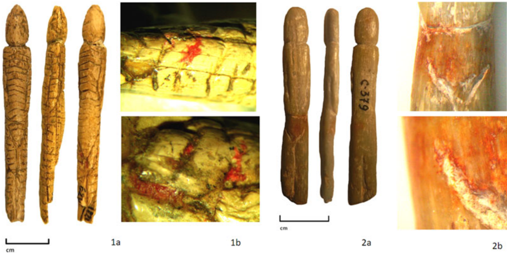
Figure 5. Images of teenage girls: (1a) Mal'ta collection (N 1822/629 State Historical Museum); (2a) Buret collection (C 379, Irkutsk Regional Art Museum); (1b, 2b) macro photos (with magnification of 10×, 20×) of the painting area with ochre.

natural mineral pigments and artificial paints in different spheres of the live Mal'ta inhabitants, include attention to figurines of pubertal age girls.