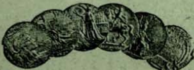
Gold Medal Allahabad 1910.

Paris 1900, Brussels 1910, Buenos Aires 1910.