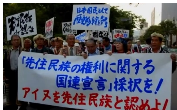
Demonstrators call for official recognition of the Ainu's rights as indigenous peoples.

But in these cases, Ainu policy as construed in terms of the constitution depends not upon clear stipulations found in the actual constitution itself, but rather on the interpretations of a handful of constitutional scholars. Moreover, Article 13 of the constitution clearly deals with the human rights of individuals (not of groups), and does so only to the extent that this "does not interfere with the public welfare". In other words, while the criteria of the United Nations Declaration on the Rights of Indigenous Peoples emphasizes the centrality of collective rights, Ainu policy falls at the exact opposite end of the spectrum: it is presented as a matter of the rights of individuals to "life, liberty, and the pursuit of happiness". Tsunemoto came to refer to this unique rights policy in 2010 as "Japanese-style Indigenous Peoples' Policy" 25 . Not surprisingly, this idea has become an extremely effective back-up for the Japanese government, particularly for central government bureaucrats who are reluctant to support group rights.