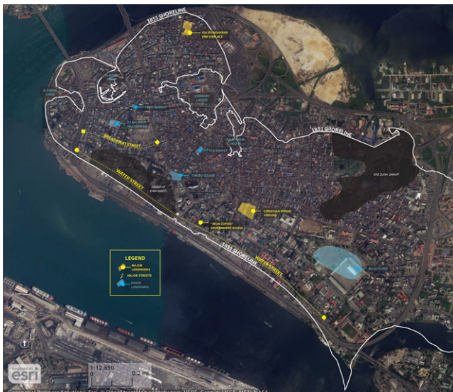
Figure 1. Five places in early colonial Lagos. The sites marked in yellow are the places where meaning an identity were debated in 1863. The map in this figure was created using ArcGIS® software by Esri. ArcGIS® and ArcMap™ are the intellectual property of Esri and are used herein under license. Copyright © Esri. All rights reserved. For more information about Esri® software, please visit www.esri.com .

Third is “Iron Coffin,” as Government House was known because of the constant turnover of consuls who died from dysentery and or malaria. Regardless, it became the focal point of the growing European settlement along Water Street. The Christian burial ground, located north east of the