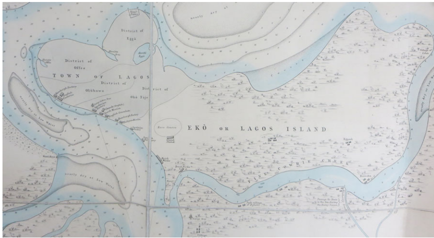
Figure 2. John Glover's 1859 "Sketch of the Lagos River." 28

they purport to represent. Harley pointed to the ways that mapmaking is a representational project, with silences and omissions that are just as powerful and significant as the features that cartographers choose to represent. It is important that scholars pay heed to the ways that maps have made and continue to make arguments about Africa and Africans. And in the ways that we use them as part of our teaching tools in the classroom. Historical maps are useful as primary sources, but their static nature means that they can usually only be read as an argument for a particular moment in time. GIS and story maps change this basic view, allowing for the reading of change through time coupled with change through space. 23 As Mares and Moschek show, the use of GIS can “turn the users themselves into the map makers.” 24 Maps, therefore, are complex renderings of place. While some scholars have argued that maps generally pose questions about space, other have shown how maps themselves can make arguments in response to both historical and spatial questions. Here, I argue that because sequential maps of the same space offer a certain intertextuality, they can both pose and answer questions.